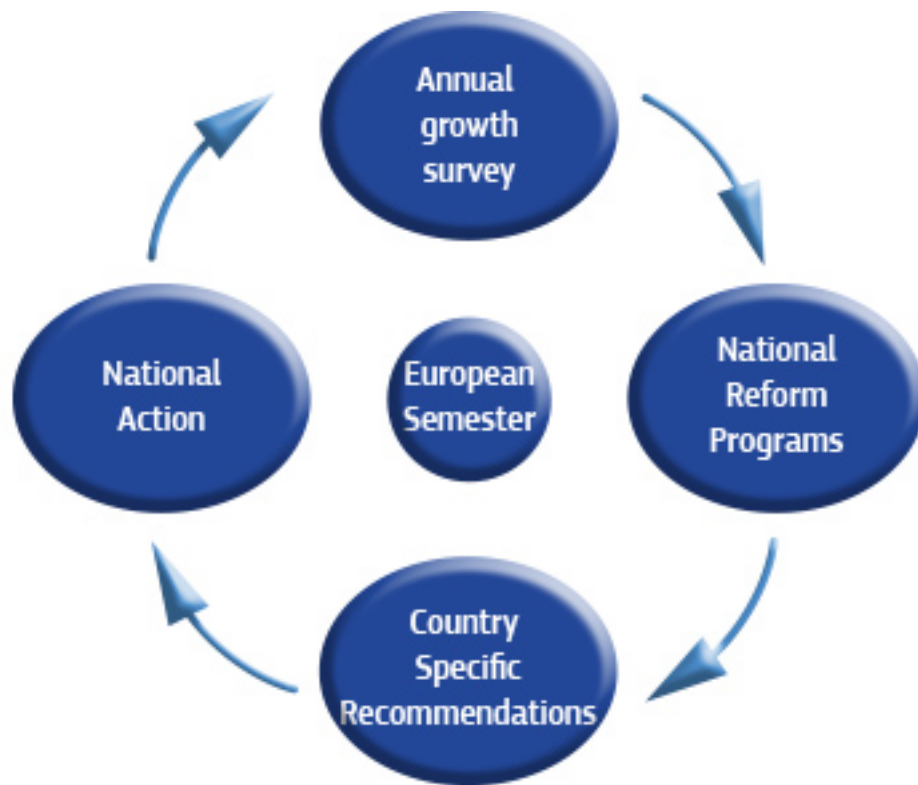
Figure 1: The European Semester Policy Coordination Cycle