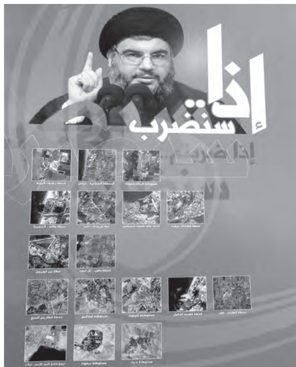
Figure 1. Propaganda Poster in the Mleeta Museum, "If you strike . . . we will strike." 72

Mleeta Resistance Museum built by Hezbollah in the South after the 2006 war. The Museum itself is filled with messages of deterrence such as maps of Israeli locations in the range of Hezbollah's missiles. (See Figure 1.)