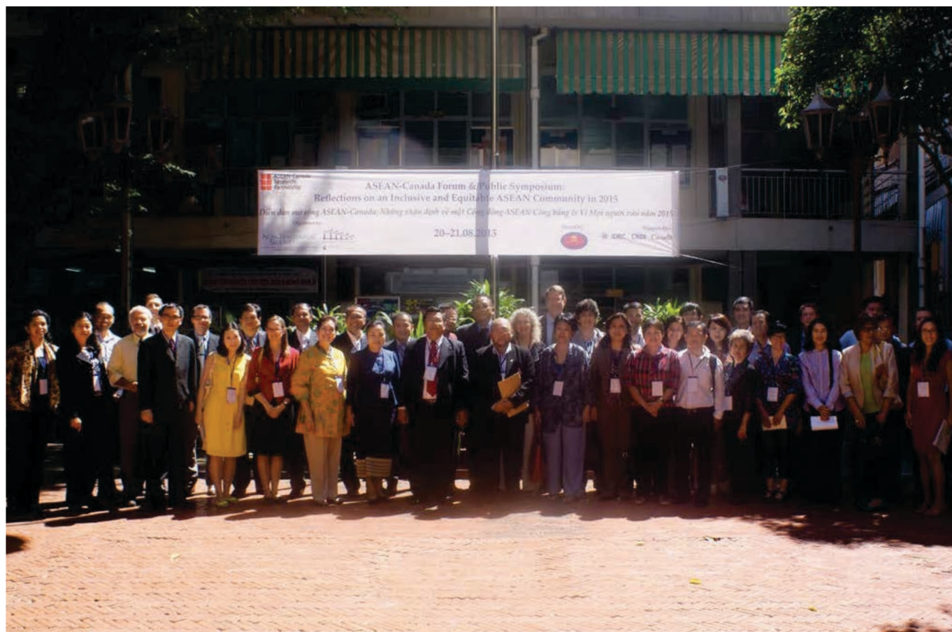
ASEAN-Canada Forum 2013 20 August 2013