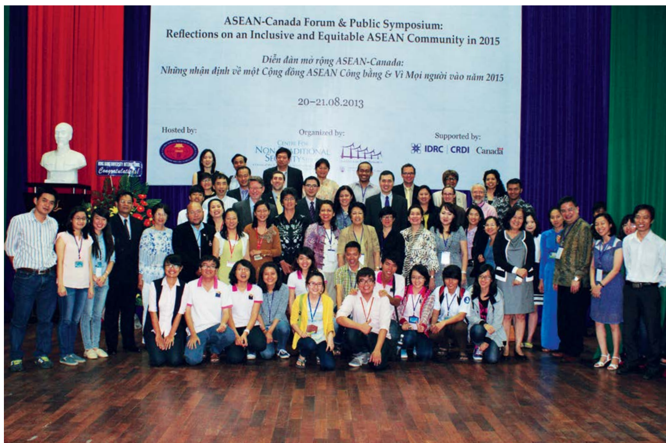
ASEAN-Canada Public Symposium 2013 21 August 2013