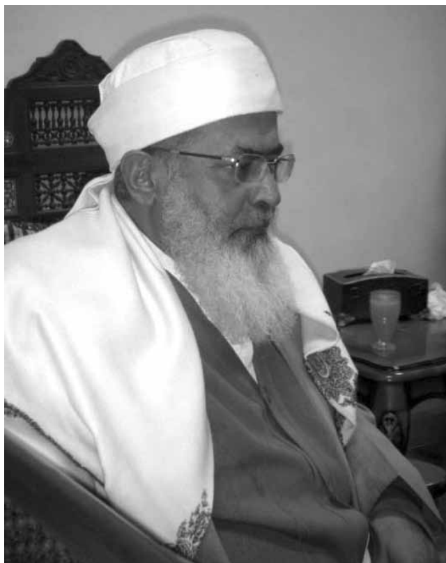
Sheikh Hassan Al-Sheikh, Deputy Minister for Endowment and Guidance and Head of Religious Affairs

Sheikh Hassan Al-Sheikh, Deputy Minister for Endowment and Guidance and Head of Religious Affairs at Saleh Mosque, opened the meeting by highlighting to the delegation that Saleh Mosque was built with the objective of spreading the message of religious moderation. He explained that the mosque's mission was to promote religious tolerance and advocate peaceful co-existence among people of different religions, thereby portraying Islam as a religion of peace and tolerance that condemns violence. Sheikh Hassan told the delegation that he often uses Prophet Muhammad's tolerant and respectful stance towards the Jews of Medina to illustrate his point of religious harmony.