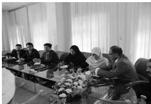
ICPVTR Delegation at the Ministry for Endowment and Guidance