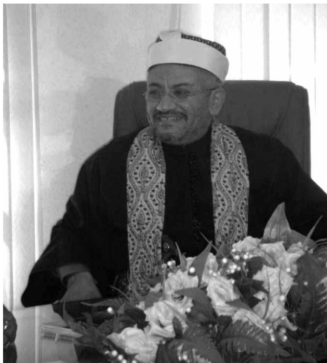
Judge Hamoud Abdulhameed Al-Hitar, Minister for Endowment and Guidance

Judge Hamoud Abdulhameed Al-Hitar is the current Minister for Endowment and Guidance. Judge Al-Hitar was the founder who headed the Intellectual Dialogue Committee (Lajnah al-Hiwar al-Fikri) when it was first established in 2002. This committee is also known as the Religious Dialogue Committee. As a former Head of Yemen Supreme Court, he has extensive experience in the country's legislation, judiciary and politics.