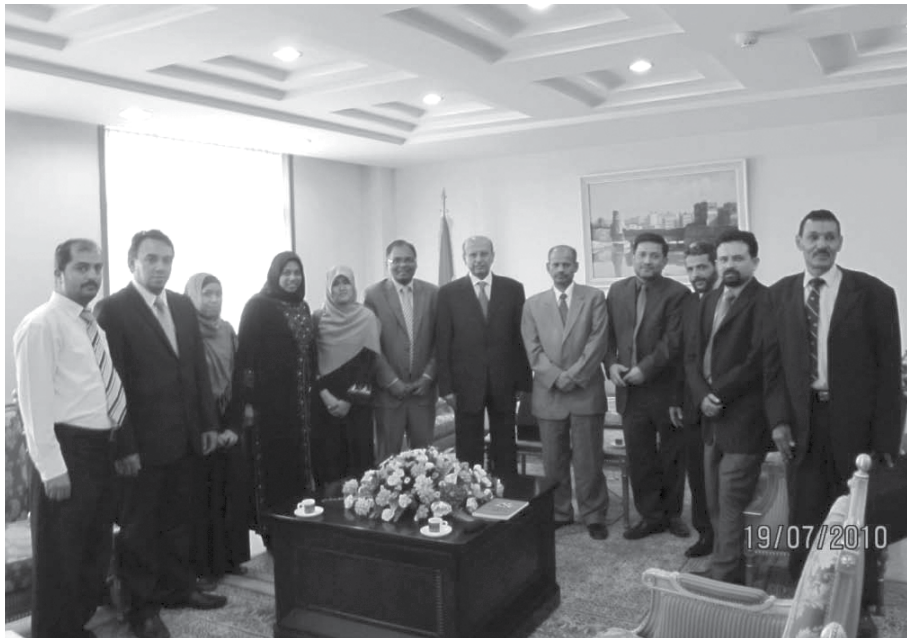
ICPVTR delegation and Dr. Abu Bakr Al-Qirbi, Minister for Foreign Affairs, Yemen

In conclusion, Dr. Al-Qirbi added that at times many in the West do not look upon the introduction of Islam to Southeast Asia in an objective manner. He opined that compared to both Middle-Eastern and Southeast Asian cultures, the West was not as moderate as they had claimed.