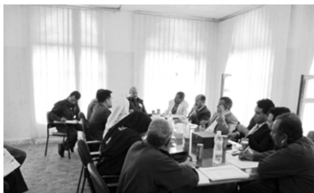
ICPVTR Delegation at Training and Development Sector Office, Ministry of Interior