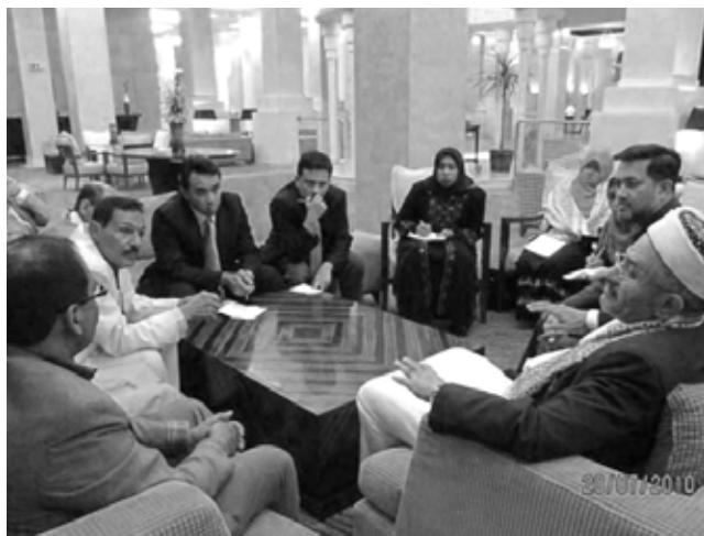
ICPVTR Delegation and Judge Hamoud Abdulhameed Al-Hitar, Minister for Endowment and Guidance of Yemen

Judge Al-Hitar began the meeting by commending the rehabilitation programme in Singapore. He added that he had been avidly following the news on Singapore. Judge Al-Hitar explained that in the aftermath of the attacks on 11 September 2001, the first rehabilitation programmes established were in three countries, namely, Yemen, Saudi Arabia and Singapore.