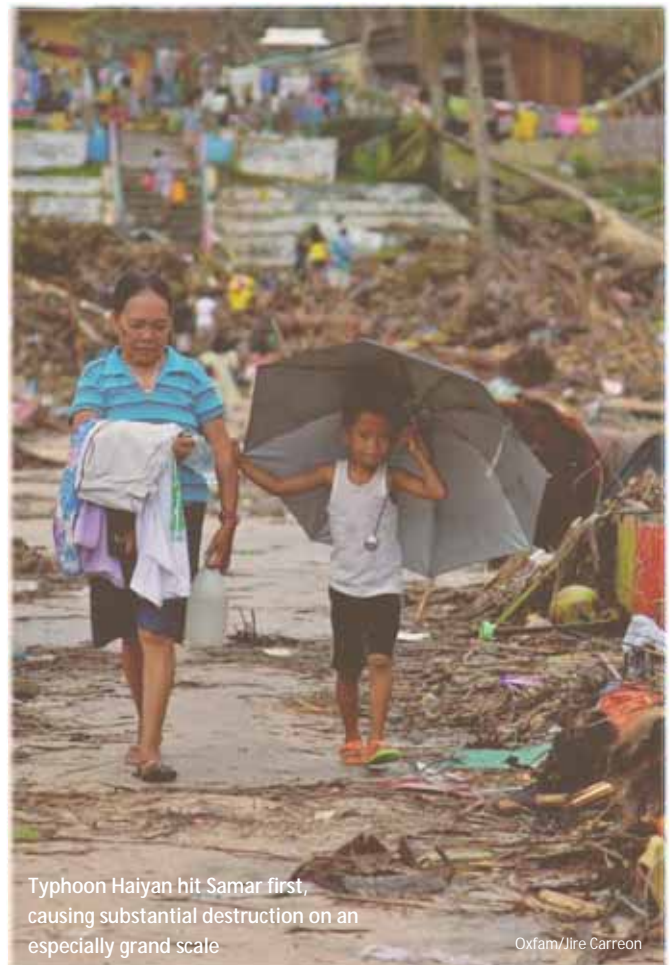
Typhoon Haiyan hit Samar first, causing substantial destruction on an especially grand scale