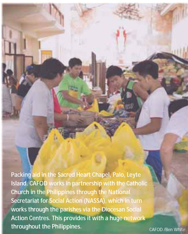
Packing aid in the Sacred Heart Chapel, Palo, Leyte Island. CAFOD works in partnership with the Catholic Church in the Philippines through the National Secretariat for Social Action (NASSA), which in turn works through the parishes via the Diocesan Social Action Centres. This provides it with a huge network throughout the Philippines.

Partnership also has costs associated with it that should not be underestimated or ignored. For the Haiyan response there was considerable investment reported by several INGOs in setting up partnership teams to identify, assess and support partner operations. The process of partner assessment itself can take several weeks and include a range of project and support staff. To address issues of absorptive capacity and to reduce perceived financial risk, some NGOs scaled up their own logistics capacity in order to undertake procurement on behalf of their partners. Several also seconded technical staff into partner organisations to make up for short-term capacity gaps. Perhaps the most important cost – and also considered by NNGOs to be one of the greatest gaps in partner investment – is in capacity development, which is essential to ensure preparedness for humanitarian response in the future.