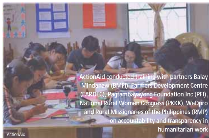
ActionAid conducted training with partners Balay Mindanaw (BMFI), Farmers Development Centre (FARDEC), Pagtambayayong Foundation Inc (PFI), National Rural Women Congress (PKKK), WeDpro and Rural Missionaries of the Philippines (RMP) on accountability and transparency in humanitarian work

EcoWEB was able to train nine senior staff during their emergency response in Mindanao in 2008–09 and the Typhoon Washi response in 2011–12, but all of them have now been recruited by international agencies. After the humanitarian response in Mindanao, four moved to INGOs; after the Washi response two moved to UN agencies and a third went to an INGO, and since Typhoon Haiyan a senior staff member has moved to a UN agency. The main reason for their departure was that they were attracted by the high salaries that tripled or quadrupled what they were receiving in national organisations. The nine staff had many years of experience working for EcoWEB between them. The trend is much the same for junior staff and volunteers who regularly move on when they have sufficient experience to compete for posts with international organisations. 64