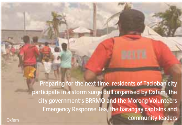
Preparing for the next time: residents of Tacloban city participate in a storm surge drill organised by Oxfam, the city government's BRRMO and the Morong Volunteers Emergency Response Team, the barangay captains and community leaders