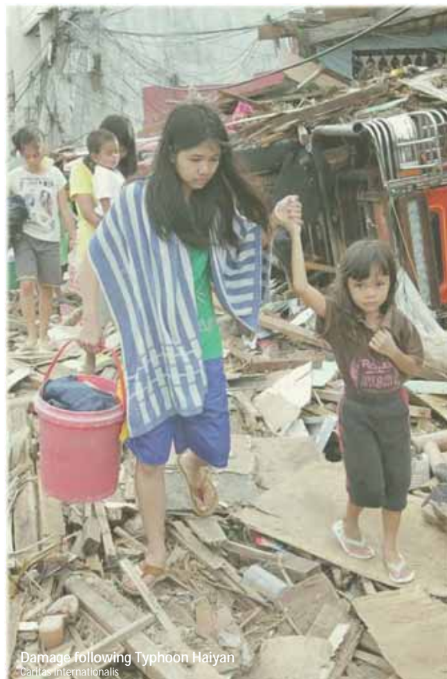
Damage following Typhoon Haiyan

Section 1 provides an introduction to the study, outlines its purpose and the approach used. Section 2 outlines the context of vulnerability and humanitarian response in the Philippines. Section 3 draws on the experience of the commissioning agencies and other INGOs to review the effectiveness of partnerships. Section 4 examines issues of partnership between the national and international humanitarian response systems, with a focus on humanitarian leadership, coordination and financing. Based on the study's findings, Section 5 presents a conclusion and a set of recommendations for how the international humanitarian community can strengthen the effectiveness of humanitarian partnerships, both in the Philippines and at a global level, in the future.