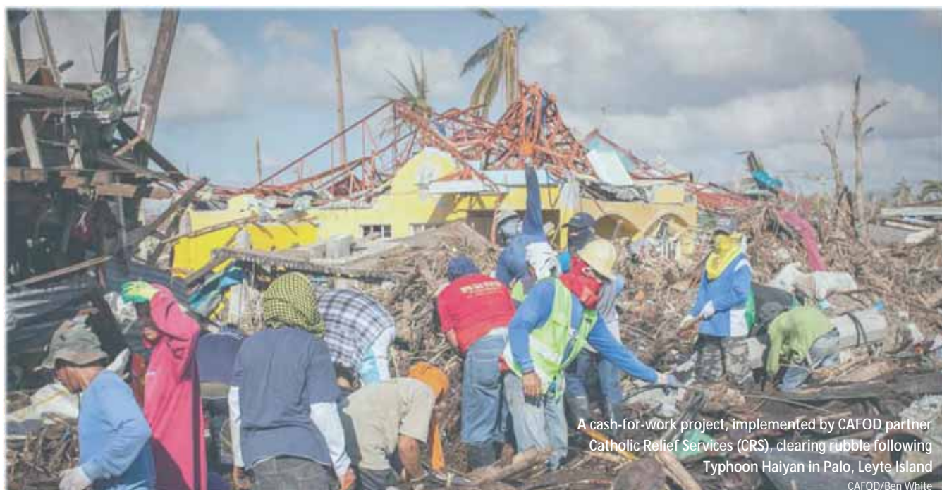
A cash-for-work project, implemented by CAFOD partner Catholic Relief Services (CRS), clearing rubble following Typhoon Haiyan in Palo, Leyte Island

While for both CARRAT and the HRC, the resources available from INGOs have been crucial to the functioning of the network and more generally for the members' activities, both initiatives seek to go beyond a sub-contracting relationship and to use the capacities of partners to provide timely, contextually relevant and effective humanitarian assistance throughout the Philippines.