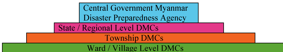
Fig 2: Disaster Management Committee Levels and flow of information

There remains insufficient detail concerning the practicalities of DMC establishment and operations. Whilst progress towards establishing committees is being made and had begun before the DM Law was finalised, much remains to be done to ensure blanket coverage of the country - and to ensure clear lines of communication are open between committees at each level.