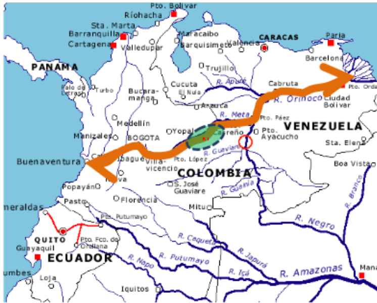
Figure 2: Regional integration axis showing the Colombian Altillanura