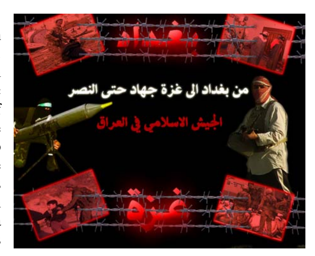
Picture 4: "From Baghdad to Gaza - Jihad until Victory" (published February 13, 2008)<sup>6</sup>

In the short term, the jihadist terrorists aim for an enlargement of their supportive patronage. Therefore, the persuasion of the receptive Muslim audience via the heightening of an Islamic identity in confrontation with the West is one of their goals. This includes the wakening of the Muslim population by luring the U.S. into conflicts on the Arabian Peninsula in order to be able to engage the enemy directly. The terrorists need Western troops and their military action in the Muslim world to implement their media strategy. The presence of troops and their actions produce the desired graphic footage of western "occupation of the Islamic nations" that furthers their media-centered strategy. It thrives on images