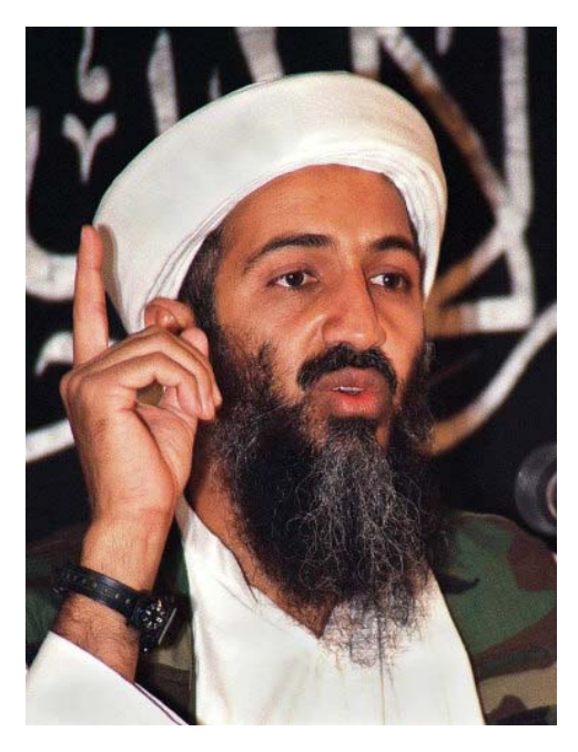
Picture 3: Osama Bin Laden (Photograph dated May 26, 1998)<sup>4</sup>

The discipline of terrorism research is relatively young and has likewise no generally accepted academic definition for terrorism. The word terror comes from the Latin word terrere, which means to frighten or scare. The concept of terrorism goes back to the 19<sup>th</sup> century. Terrorism as a political-military strategy has existed for about 40 years. The recent combination with the global mass media has allowed terrorism to reach a global dimension. In this paper, terrorism is defined as political violence in an asymmetrical conflict that is designed to induce terror and psychic fear (sometimes indiscriminate) through the violent victimization and destruction of noncombatant targets (sometimes iconic symbols). Such acts are meant to send a message from an illicit clandestine organization. The purpose of terrorism is to exploit the media in order to achieve maximum attainable publicity as an amplifying force multiplier in order to influence the targeted audience(s) in order to reach short- and midterm political goals and/or desired long-term end states.