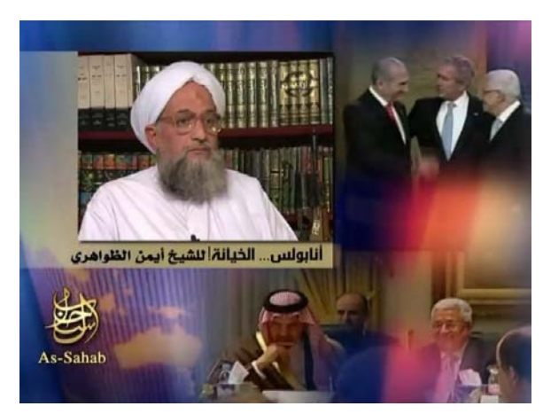
and Picture 6: As-Sahab HQ 92<sup>nd</sup> (Video released in 2007)<sup>8</sup>

more coverage it usually receives in the new media. Thereby the terrorists reach the global public, including any desired audience. They recognized the revolutionary significance of the evolution of the media infrastructure, perceptive of the fact that using strategic communication management can be on equal footing with conventional armed forces. In the media, international terrorism has at its disposal an instrument of substantial power with which it can compensate for a significant part of its asymmetry in military might. Terrorists have adapted innovative 21^{st} century information communications technologies and the associated