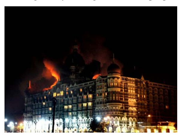
November 26, 2008<sup>10</sup>

Jihadist terrorists now resort to the tactic of Picture 7: The Taj Mahal Palace Hotel in Mumbai on "guideless resistance", in which responsibility rests solely with the decentralized operator. Abu Musab