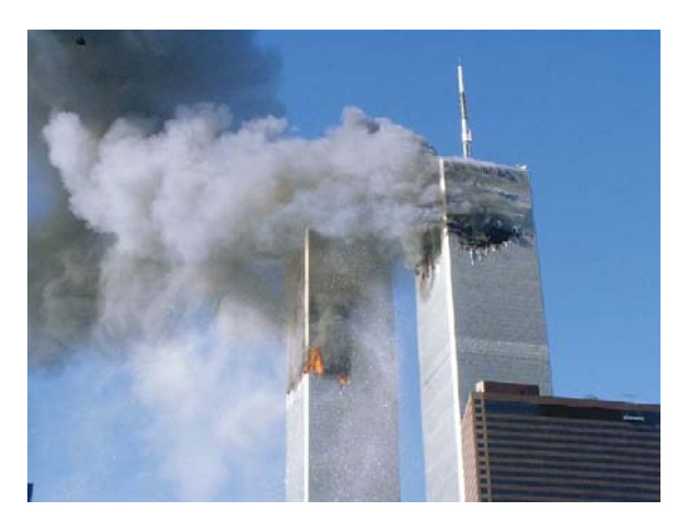
York, September 11, 2001<sup>2</sup>

During the Cold War, military conflicts were largely determined by the policy of the USA and the USSR and were therefore part of the East-West conflict. Since this symmetrical-global conflict was decided in favor of the West, numerous asymmetrical conflicts have erupted around the globe in the aftermath. Terrorist actions, like the attack in Mumbai, India in November 2008, have become a worldwide menace. Jihadist terrorism<sup>1</sup> has spread beyond the borders of the regions in Picture 1: Twin Towers World Trade Center, New