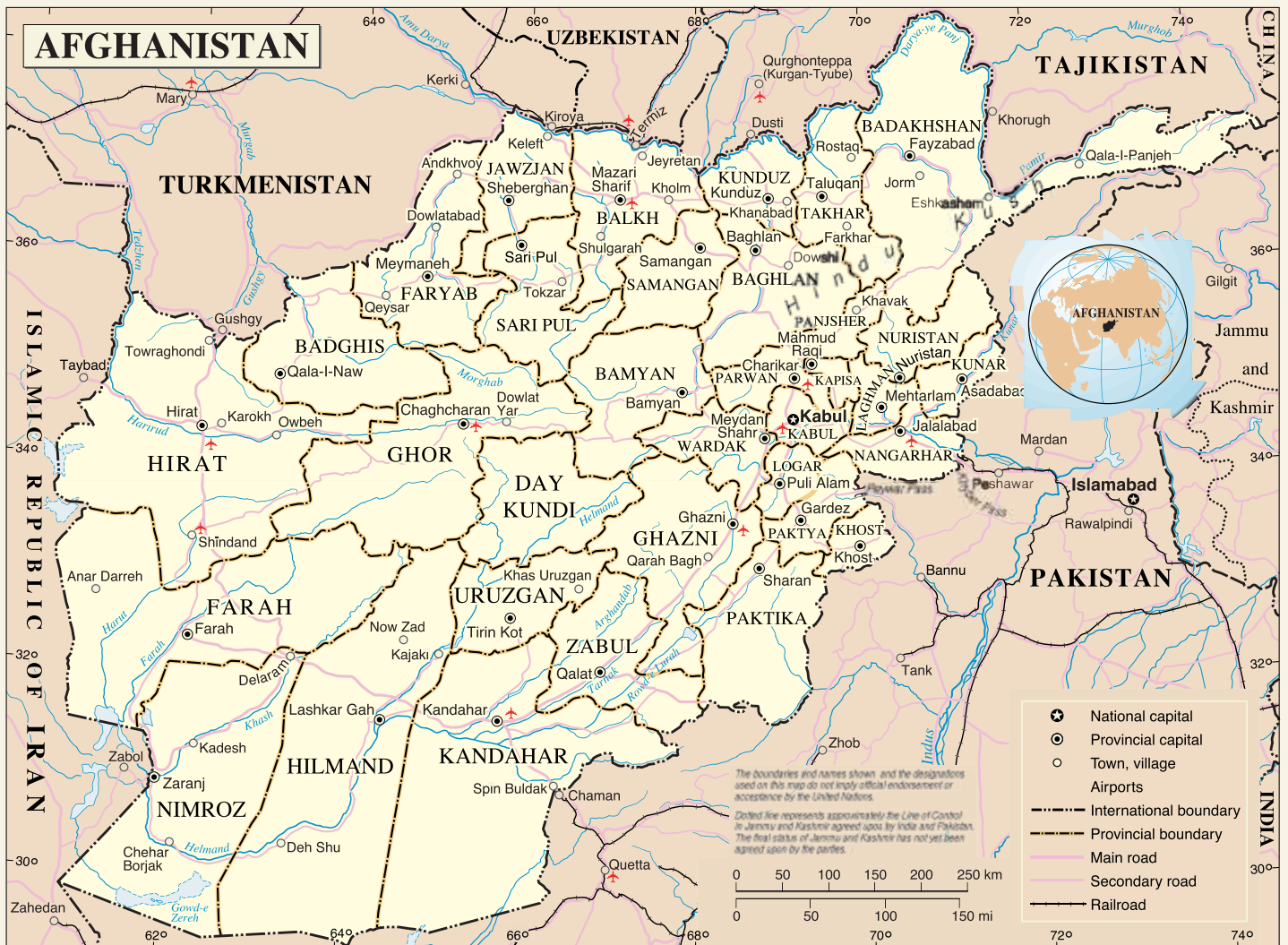
Map No. 3958