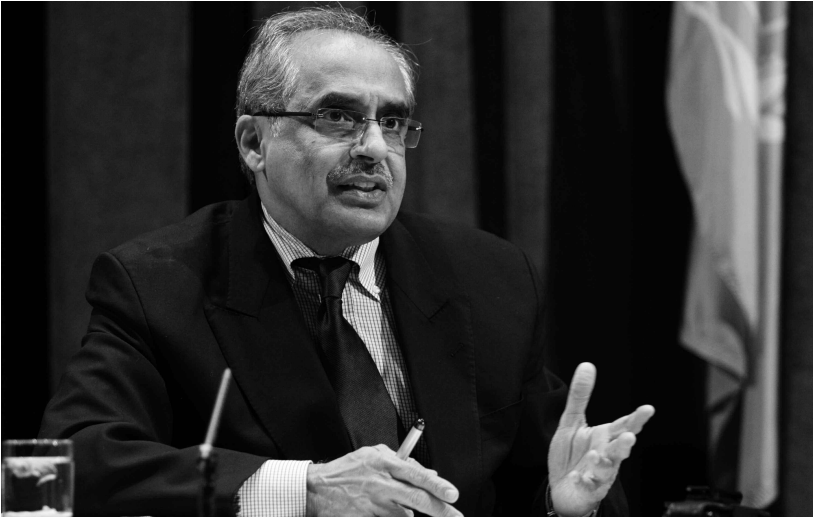
Vijay Nambiar.

meeting of heads of UN agencies to develop a common platform for “system-wide engagement on socio-economic and development issues,” consistent with the three-pillar approach. 3 A later request to visit Myanmar in August was rejected by the government.