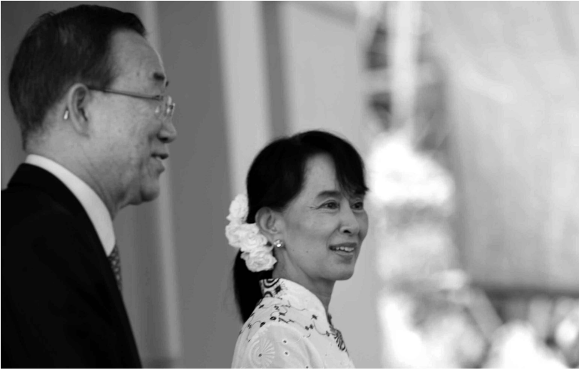
Secretary-General Ban Ki-moon at a joint press stakeout with Aung San Suu Kyi, Yangon, Myanmar, May 1, 2012.

than 80 percent of the vote. In May she took her seat in Naypyitaw as a new member of Parliament (MP).