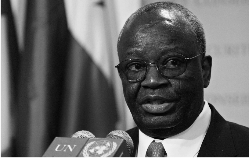
Ibrahim Gambari.

Myanmar context than the previous envoy. Also important for the protocol-conscious Myanmar leadership was that, as Under-Secretary-General, Gambari had a higher rank than any of the previous envoys.