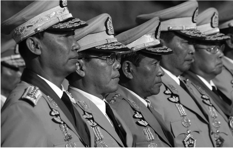
The ruling generals of the Myanmar government look on during Armed Forces Day on Sunday, March 27, 2005, in Yangon.

group. But he did not have much to work with. The United States, having fired another sanctions salvo in June 2003 with little effect, had returned to its default position of non-engagement apart from regular symbolic statements of protest over Aung San Suu Kyi's continued house arrest and condemnation of the National Convention. The EU was hesitant both to apply more sanctions, which it worried would simply hurt Myanmar's ordinary people, and to attempt further engagement that would be politically costly with domestic constituencies. ASEAN at this point was largely behind the SPDC's roadmap and basically inclined to wait and see where the National Convention would lead. Thailand, in December 2003, had convened a meeting of ten like-minded member states in Bangkok to discuss ways to encourage more inclusive processes within the context of the roadmap, which was the first of any such international meetings that included Myanmar. There was some talk about further meetings in what was dubbed the "Bangkok Process," but it all fizzled out. The Western participants were widely criticized by pro-democracy groups for even participating, and Myanmar subsequently let it be known that it was unwilling to return except to report on subsequent steps of the roadmap.