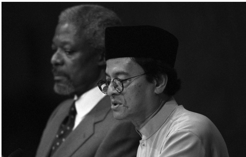
Secretary-General Kofi Annan and Razali Ismail.

little more than “just go there and observe how things were going.” 2 Alvaro de Soto’s end-of-assignment report was given to him as a handover note. With little involvement of the Secretary-General and the Secretariat, the envoy and his team were left to their own devices. Nothing was prepared in advance of his first trips. Plans were made as they went.