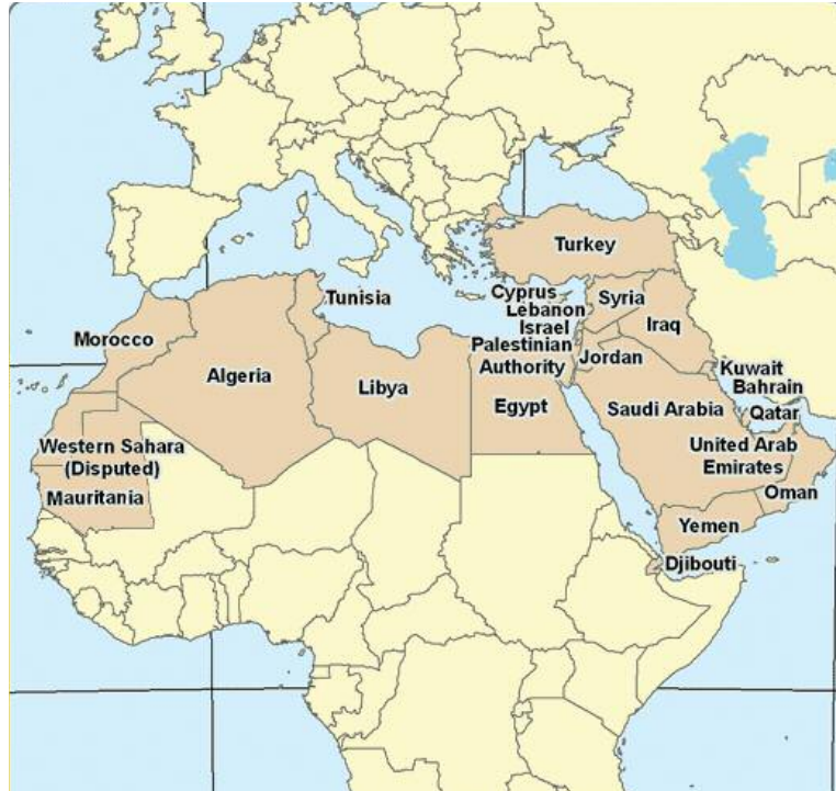
Map of North Africa and the Middle East.

In Egypt, for example, 95 percent of the popula-