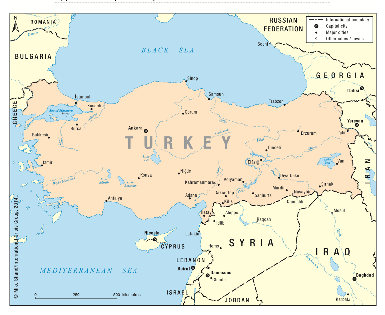
Appendix A: Map of Turkey