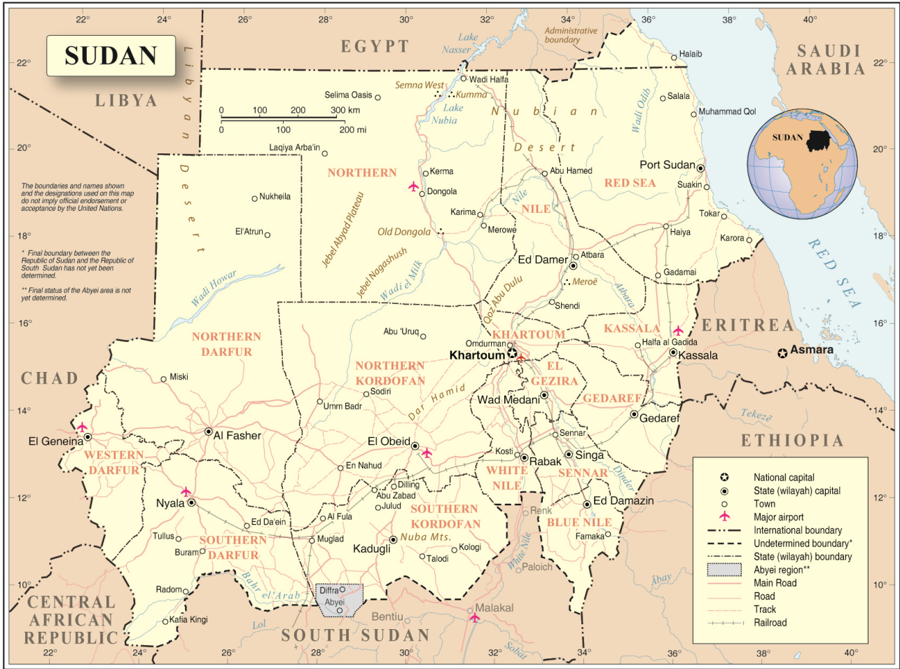
Map No. 4458 Rev.2 UNITED NATIONS March 2012