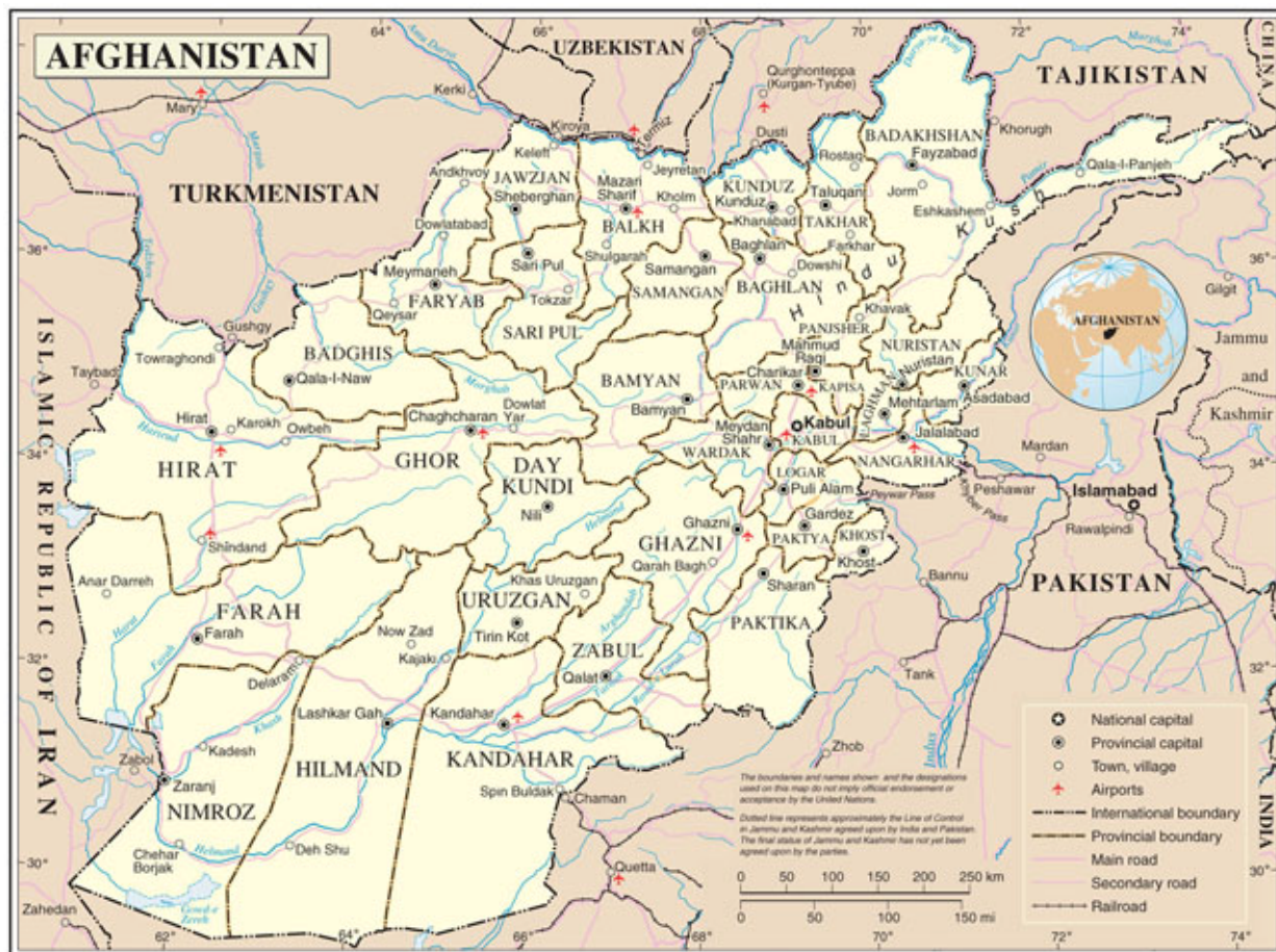
Map No. 3956 Rev. 6 UNITED NATIONS July 2009

Department of Field Support Cartographic Section