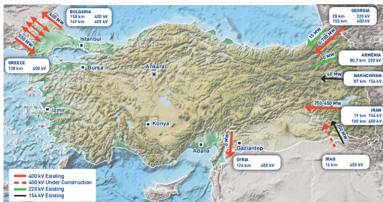
Figure 1 | Turkish electricity transmission system is interconnected with neighbours

Moreover, the transmission system design characteristics and operation principles in Turkey are in accordance with the Transmission System Grid Code Regulation and Electric Transmission System Supply Reliability and Quality Regulation. Both of the regulations and system operation principles are in line with ENTSO-E (European Network of Transmission System Operators for Electricity) best practices. The Turkish system has been synchronously connected to the ENTSO-E system since September 2013. The parallel trial interconnection of the Turkish power grid with the ENTSO-E's Continental European Synchronous Area is in the final stage. It is expected to be fully functional by the end of 2014. Today, Turkey has two tie-lines to Bulgaria and one to Greece. The Turkish electricity system can benefit from the synchronous interconnections with the European platform of ENTSO-E, which will be further developed in the future to increase the cross-border capacity with Europe, and thus improve trading opportunities.