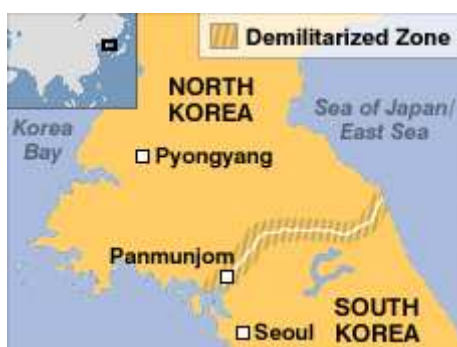
Figure 3. Korean Military Demarcation Line (MDL)

Demarcation Line (MDL), also known as the Armistice line, set in 1953. The MDL runs across 238 km, dividing the two countries. 29 In the village of Panmunjom, bridging between the two, the armistice agreement was signed in 1953. Today it is one of the few zones where Northern and Southern troops directly face each other. 30