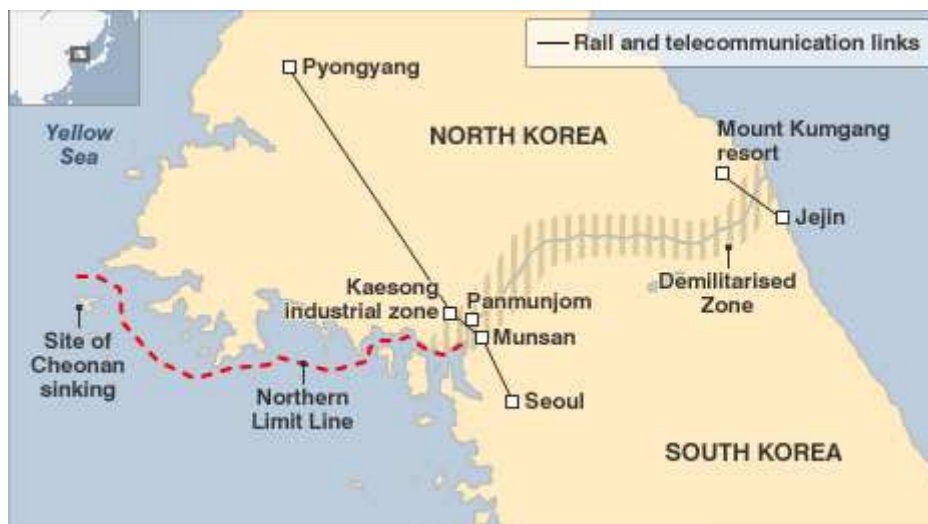
Figure 1. Demarcation line fixed at the end of the 1950-53 Korean War

Cold War and formally never ended. In 1953 the parts signed an armistice agreement, 12 and, since then, the borders around the 38 th parallel have been frequently shaken by military clashes.