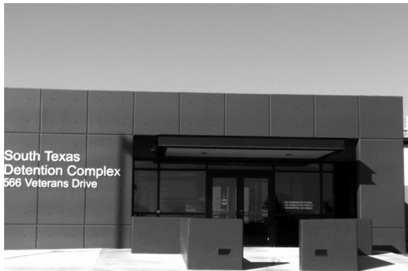
South Texas Detention Center in Pearsall holds almost 1,500 ICE detainees.

Yet two years later, the overwhelming majority of detained asylum seekers and other civil immigration law detainees are still held in jails or jail-like facilities—almost 400,000 detainees each year, at a cost of over $2 billion. At these facilities, asylum seekers and other immigrants wear prison uniforms and are typically locked in one large room for up to 23 hours a day; they have limited or essentially no outdoor access, and visit with family only