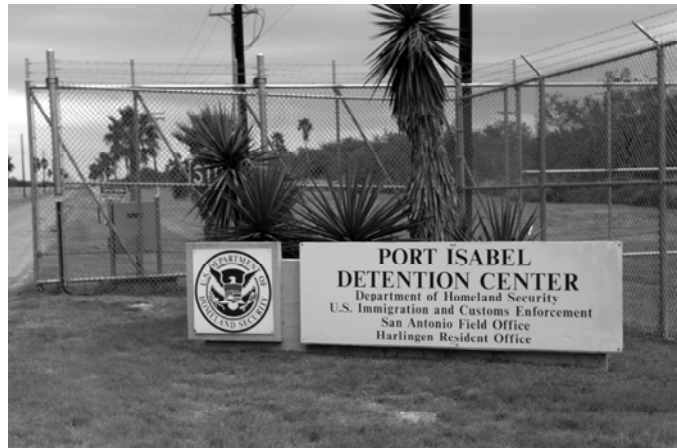
Port Isabel Detention Center in Harlingen, Texas, holds 850 ICE detainees.

No contact visits: In many facilities, also regardless of criminal history or lack thereof, detainees can visit with their family and friends for just 30 minutes at a time, only on specific days of the week, and only via telephone, sitting across from each other, separated by glass or Plexiglas dividers. 46 Even worse, in some facilities, "visits" take place only via video, even when visitors are in the same building as detainees, including at Pinal County Jail (Arizona), which houses more than 400 men. Detainees at Pinal County are not permitted contact visits even with their attorneys. 47 Other facilities that permit visits only via video include Douglas County Corrections (127 detainees), Baker County jail (250 detainees),