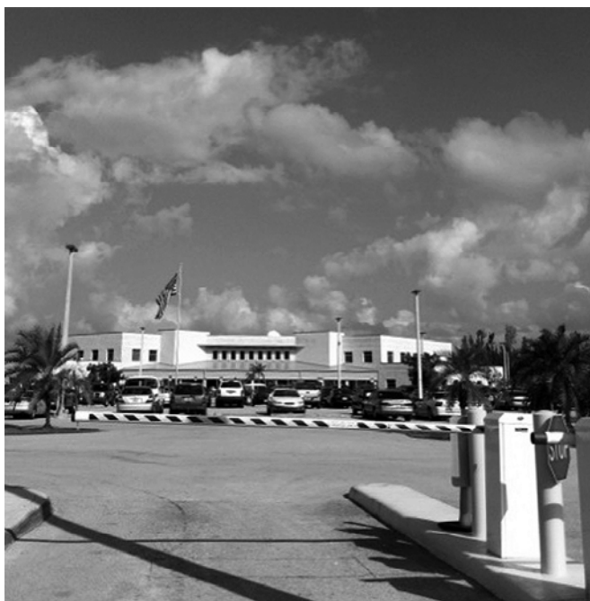
Krome North Service Processing Center in Miami holds 600 ICE detainees.

As detailed in Human Rights First's 2009 report, as DHS and ICE expanded immigration detention, they repeatedly chose to detain asylum seekers and other immigrants in facilities located in areas that are not near pro bono legal resources, the immigration courts, or U.S. asylum offices. 217 Detained asylum seekers and other detained immigrants have very little access to legal representation or even legal information, and the location of many immigration detention facilities can add to the already significant difficulty of finding and retaining competent counsel. At many of these remote facilities, immigration officials are also—increasingly—turning to the use of video-conferencing to conduct immigration court hearings and even credible fear screening interviews, compounding the challenges that immigration detainees face in accessing justice.