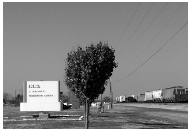
Hutto Detention Center in Taylor, Texas, holds 450 ICE detainees.

Over the past two years, the Departments of Justice and Homeland Security have declined to accept the recommendations of the bipartisan federal National Prison Rape Elimination Commission relating to standards for facilities holding immigration detainees.