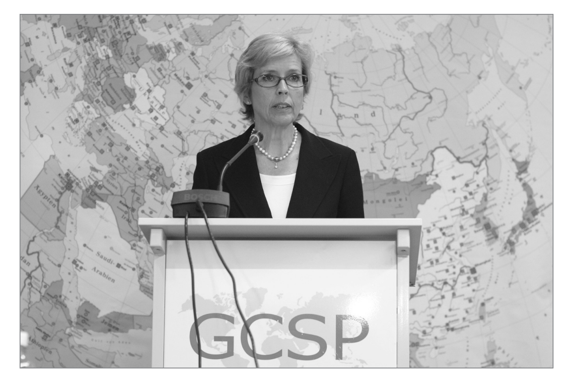
Norwegian Minister of Defence, Anne-Grete Strøm-Erichsen

a number of participants from relevant institutions, including European development, military, and police establishments, actively participated.<sup>2</sup>