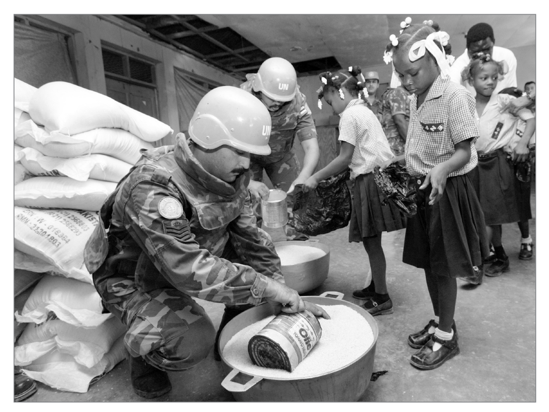
MINUSTAH's Jordanian Battalion assists a school, Lycée de Damia, near Cité Soleil (their Area of Responsibility). The Jordanian Battalion 1 delivers milk, rice, flour and tea, all of which come from their own supplies of food, to 600 students. Port-Au-Prince, Haiti. 22 February 2006

Following the Minister's remarks, discussions centred on a number of topics that drew lessons learned from missions as well as from officials' experiences within headquarters. Collectively, participants had a rich experience in all aspects of integrated missions. This report is a synthesis of the discussions held. The meeting was run under Chatham House Rule.