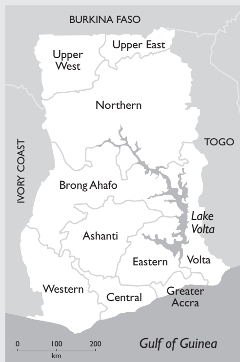
Figure 1. Administrative Regions of Ghana