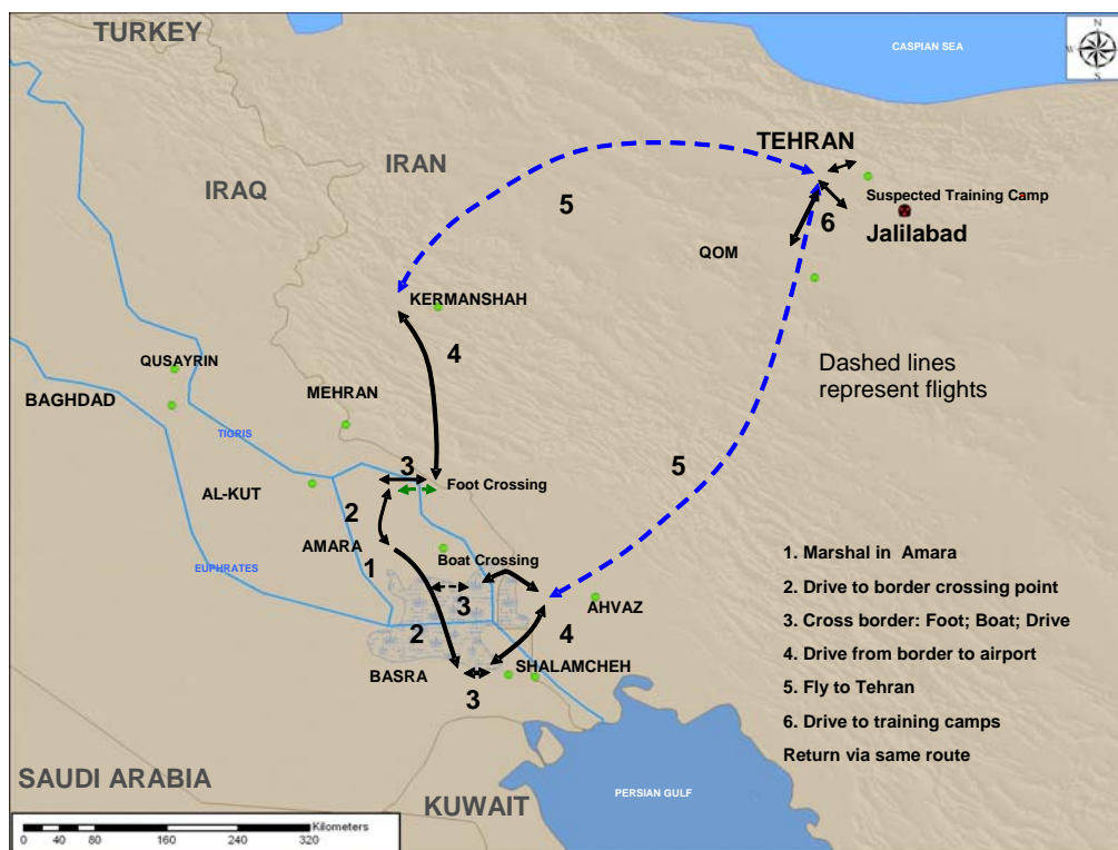
Figure 3: Common Routes Traveled to IRGC-QF Paramilitary Training in Iran

Figure 3 depicts the most cited routes from Iraq to training facilities in Iran according to Iraqi militants that participated in this training since 2006.