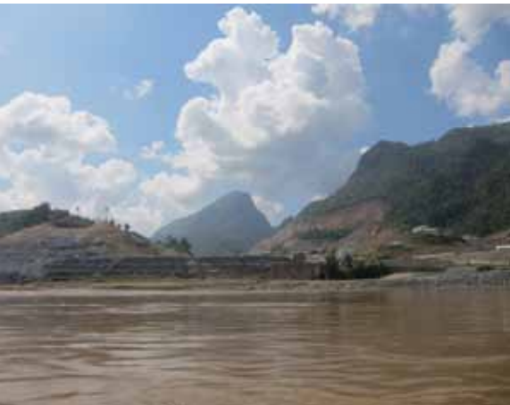
The site of the Xayaburi dam at the beginning of its construction in 2012. The dam is nearly half complete, according to the Thai firm tasked with its construction.