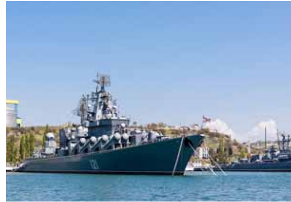
The Russian guided-missile cruiser Moscow, docked in Sevastopol. The Moscow has traveled from the Black Sea to the South China Sea and is expected to conduct live-fire exercises after leaving port in Singapore.

• Singapore to provide military personnel and equipment to support the fight against Islamic State. Singaporean defense minister Ng Eng Hen on November 3 announced that Singapore will contribute military personnel and aerial-refueling planes to the international effort to fight the Islamic State in Iraq and Syria (ISIS). Ng said ISIS posed a direct threat to Singapore and the region. About 350 Southeast Asians, including from Singapore, have reportedly joined ISIS in Iraq and Syria. Singapore is the first Southeast Asian country to join the U.S.-led coalition against ISIS.