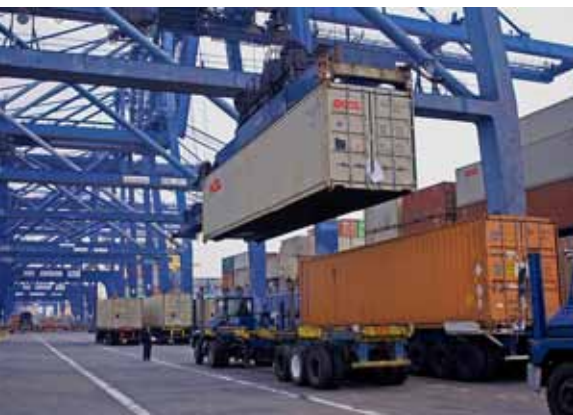
Trucks line up for unloading at the Tanjung Priok port in North Jakarta. President Joko Widodo recently urged international CEOs to invest in infrastructure projects in Indonesia, including desperately needed port upgrades.