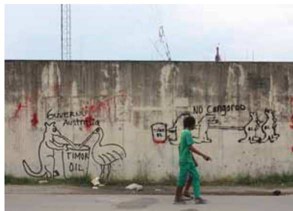
Graffiti on the Australian Embassy in Timor-Leste highlights Timorese frustration with Australia over a long-running maritime dispute about oil and gas fields. Timor-Leste's Parliament recently authorized the reopening of negotiations with Australia in the hope of resolving the dispute.