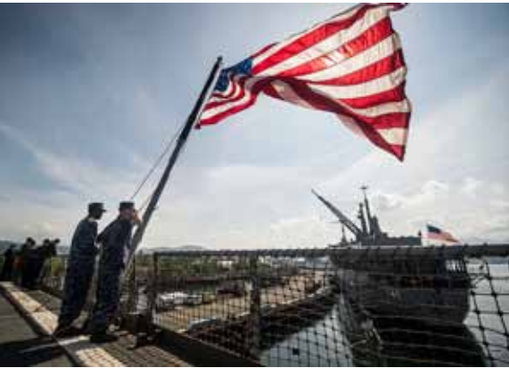
U.S. troops in Subic Bay raise a flag aboard the USS Germantown during joint amphibious exercises in September. Nine U.S. naval vessels reportedly canceled planned visits to Subic Bay following a rise in anti-American sentiment over the alleged murder of a transgender Filipina by a U.S. Marine.