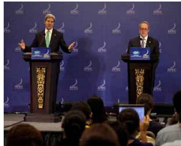
Secretary of State John Kerry and United States Trade Representative Michael Froman at an Asia-Pacific Economic Cooperation (APEC) press conference in Indonesia on October 5, 2013. Leaders and negotiating teams from the 12 Trans-Pacific Partnership negotiating countries met on the sidelines of the recent APEC summit in Beijing, but failed to conclude an agreement. https://www.flickr.com/photos/apec2013/10096007236/in/photostream/