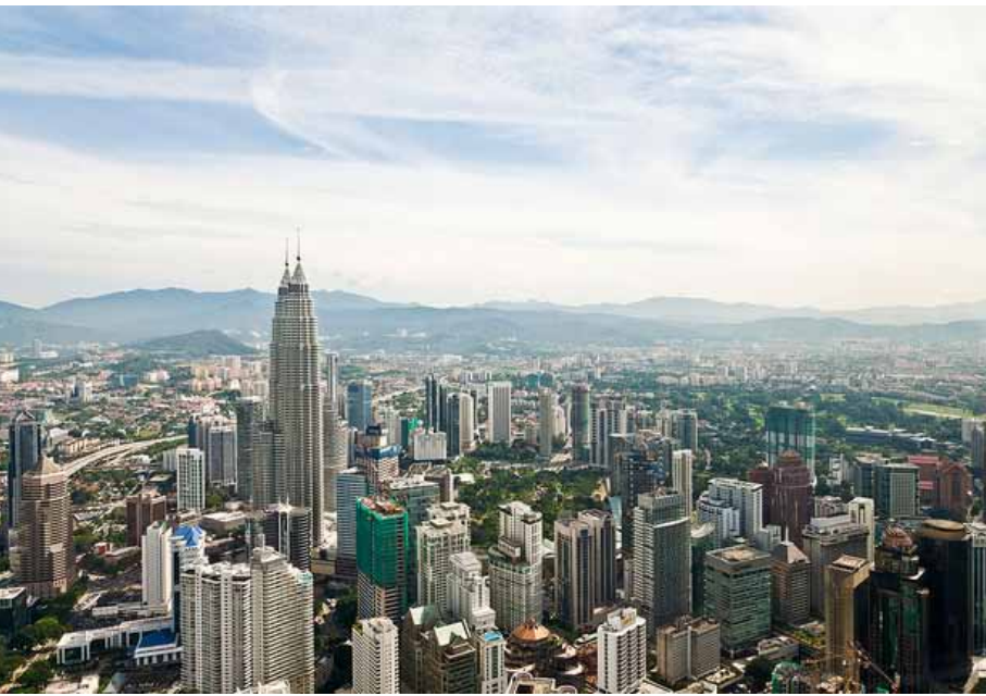
The skyline of Kuala Lumpur. The city will play host to meetings related to ASEAN, the ASEAN Regional Forum, and the East Asia Summit, among others, as Malaysia takes over as ASEAN chair for 2015.

Malaysia enjoy strong commercial ties and longstanding military-to-military cooperation. Malaysia is a member of the Trans-Pacific Partnership (TPP) free trade negotiations, and President Obama and Prime Minister Najib Razak in April announced the upgrading of bilateral relations to a comprehensive partnership.