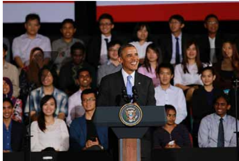
President Barack Obama delivers remarks at a Young Southeast Asian Leaders Initiative town hall event in Kuala Lumpur in April 2014. U.S.-Malaysia relations were upgraded to a comprehensive partnership during Obama's visit, which raises the importance and opportunities for the United States to support Malaysia as ASEAN chair in 2015. https://www.flickr.com/photos/statephotos/14053716863/in/set-72157644195647516

On the South China Sea, Malaysia will likely seek to work closely with both its ASEAN peers and China. A claimant in the South China Sea, Malaysia