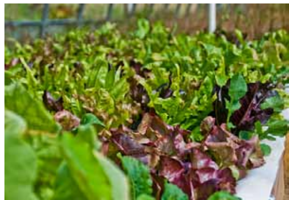
Various greens grown at an aquaponic farm. Agrotechnology company BfB has partnered with Bruneian government agencies to promote aquaponics as a means to promote food security and sustainable farming in the sultanate.