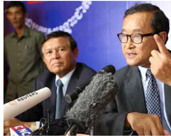
Vice President of the National Assembly and the Cambodia National Rescue Party (CNRP) Kem Sokha (left) seated with Cambodian National Rescue Party president Sam Rainsy at a press conference. Sokha has sent a letter to Australia's ambassador to Cambodia asking for Canberra to reconsider its deal with Phnom Penh to resettle refugees in Cambodia.