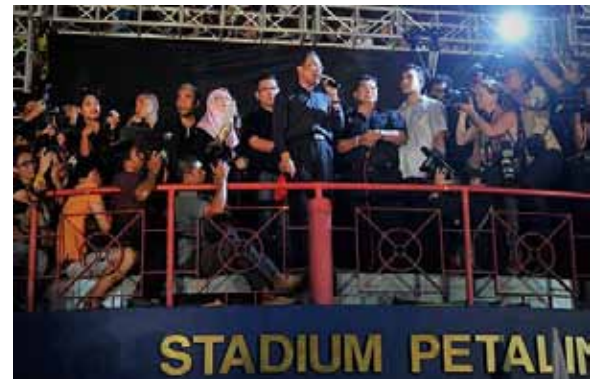
Opposition leader Anwar Ibrahim addresses supporters during a rally after Malaysia's last general election on May 8, 2013. Anwar is awaiting a court verdict in his final appeal against a sodomy conviction that could see him jailed.