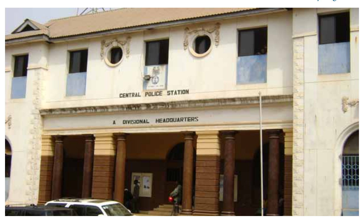
Central police station, Freetown.

Rank-and-file SLP officers face a daily struggle to support themselves and their families. One junior OSD officer explained that he was paid 250,000 leones per month (approximately $58), while a sack of rice cost 180,000 leones.<sup>33</sup> He had a wife and three children and was the only wage