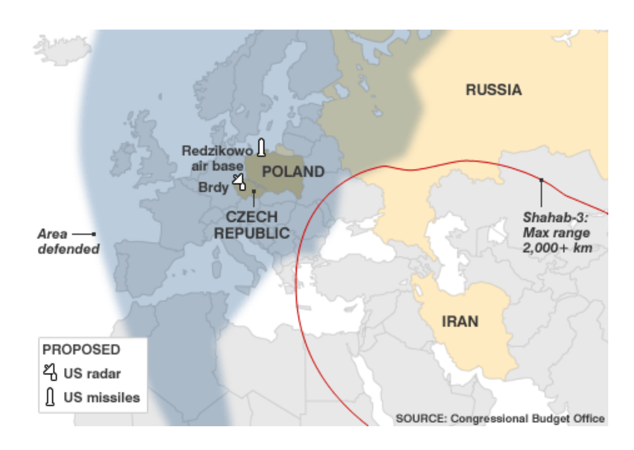
Figure 11.6: Cancelled European land-based system 43

Figure 11.4 below illustrates the now defunct Europe-based missile defense system and the maximum range of Iran's Shahab-3 missile.