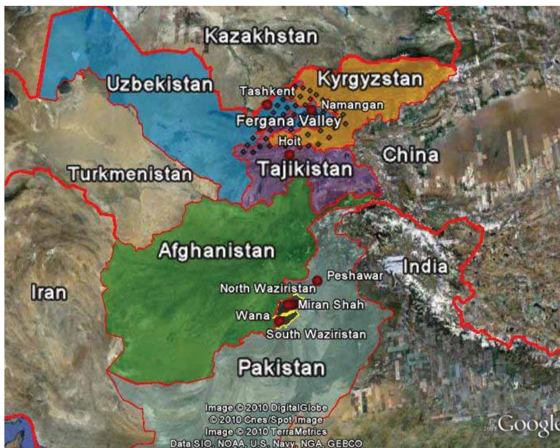
Map 1. Southern Central Asia, Afghanistan, and Northern Pakistan