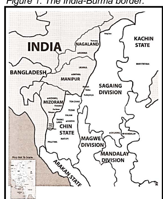
Figure 1: The India-Burma border.

This research paper focuses primarily on the urban Burmese refugee population in Delhi. Among these refugees are members of Myanmar's many ethnic groups, including Chins, Burmans, Kachins and Arakanese. The majority are from Chin State, the poorest state in Myanmar, and belong to different sub-tribes (Matu, Hakha, Falam, Zomi, Lushai, Mizo, Zo, Asho, Lai and Khumi). The proximity of Manipur and Mizoram (in India) to Myanmar's border territories accounts for the predominance of Chins and of minorities from Kachin State and Sagaing Division (see Figure 1).