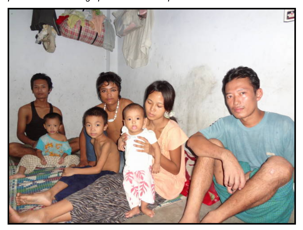
Figure 4: Many Burmese refugees live in urban villages, often sharing rooms with extended family members. A family of seven in their one-room abode is pictured here. Photograph taken on 15 September 2011.