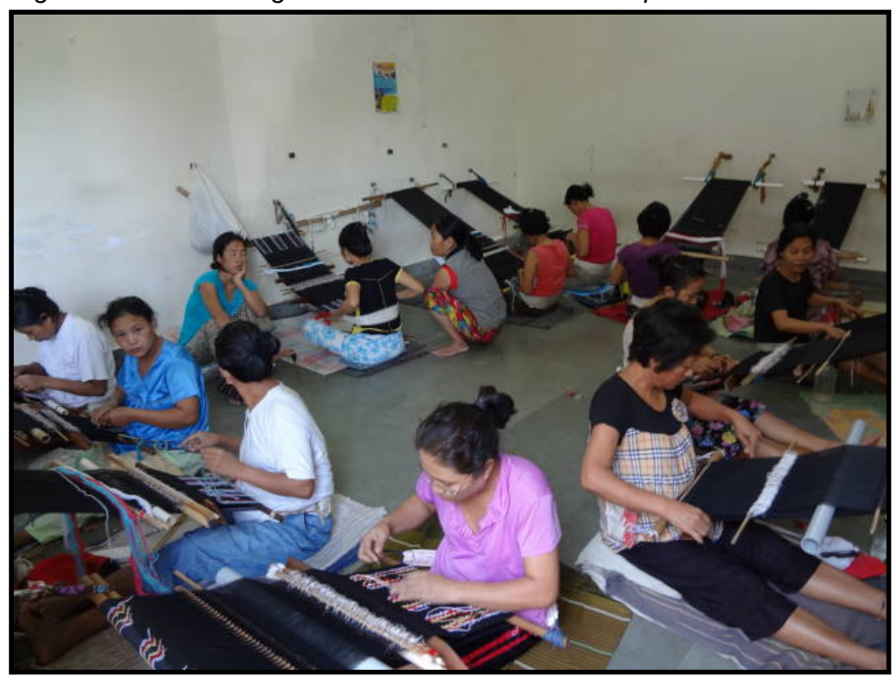
Figure 3: Women refugees at work at the Don Bosco production centre.

Although the self-sufficiency of refugees through employment is a key goal, there are many obstacles hampering their efforts. Employers hesitate to hire illegal workers and women are pushed into the informal labour market where they work in low-skilled and low-paying jobs, at factories and restaurants, and as cleaners and domestic helpers. <sup>32</sup> Others are self-employed, stitching traditional clothes and bags or undertaking small-scale catering services. Some have found employment under the Koshish enterprise at the Don Bosco production centre in Vikaspuri where they are trained in weaving and sewing. Women refugees mention various problems at the workplace including language barriers, exploitative working conditions, inequality in wages, and assault.