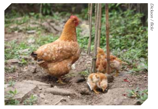
H5N1 continues to be a concern in 2011, with outbreaks reported in India, and claims of a new strain emerging in China and Vietnam.

With this in mind, the World Health Organization (WHO) Review Committee on the Functioning of the International Health Regulations (2005) in relation to Pandemic Influenza (H1N1) 2009 released its final report in May. The committee was established to assess the WHO responses to the 2009 H1N1 outbreak and