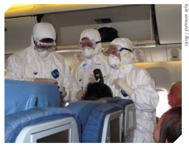
Scanning of airline passengers was one of the responses implemented during the 2009 H1N1 pandemic.

investigate claims that the responses were unduly influenced by pharmaceutical companies. It found that the WHO performed well during the pandemic despite shortcomings which included the absence of a consistent, measurable and understandable depiction of pandemic severity; an excessively complex pandemic phase structure; and systemic difficulties in vaccine distribution. The report also concluded that there was no evidence of malfeasance, noting that the WHO delayed declaring H1N1 as a Phase 6 pandemic until they had proof of sustained spread in multiple regions. Additionally, it reported no evidence of commercial influence on advice given to or decisions made by the WHO on H1N1. The committee asserted that the assumption that commercial influences account for WHO actions 'ignores the power of the core publichealth ethos to prevent disease and save lives'.