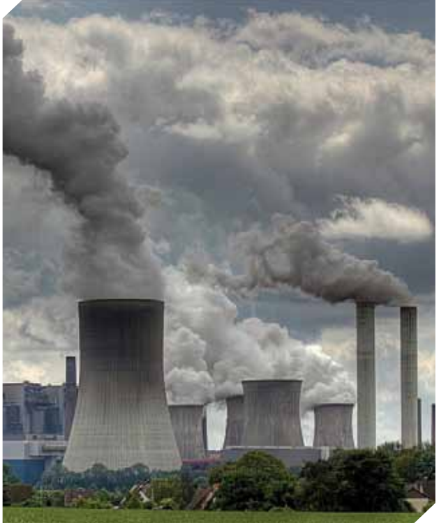
Coal power plant.

In Asia, conversely, while the Fukushima incident has certainly resulted in more silence around nuclear projects, multiple countries remain determined to continue expanding their nuclear sector. The fundamental reasons for the interest of Asian countries in nuclear energy projects are still valid in the post-Fukushima world and they will likely continue to