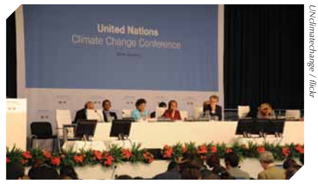
UNFCCC Meeting in Bonn, June 2011.

a starting point for redoubling efforts to understand the impacts of implementing various carbon mitigation measures. Fortunately, UNFCCC Executive Secretary