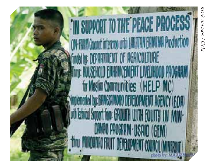
MILF's Camp Darapanan in the southern Philippines.

Moro Islamic Liberation Front (MILF) leader Al Haj Murad Ebrahim in Tokyo, Japan, resolution difficulties remain. The central issue of contention is the same as in Papua – the governments largely see these issues through an economic lens, whereas the MILF in Mindanao and the Free Papua Movement (OPM, or Organisasi Papua Merdeka) view these conflicts in terms of identity politics. An NTS perspective recognises that both these lenses are needed to comprehensively understand conflict dynamics in the region. One noticeable difference between the conflict in Indonesia and that in the Philippines is the formalised nature of the peace talks in the Philippines and the absence of this in Indonesia.