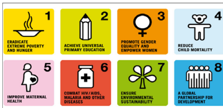
FIGURE 1: THE EIGHT MDGs