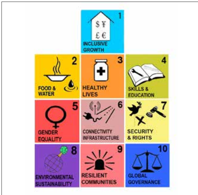
FIGURE 2: THE CIGI-KDI POST-2015 ILLUSTRATIVE GOALS