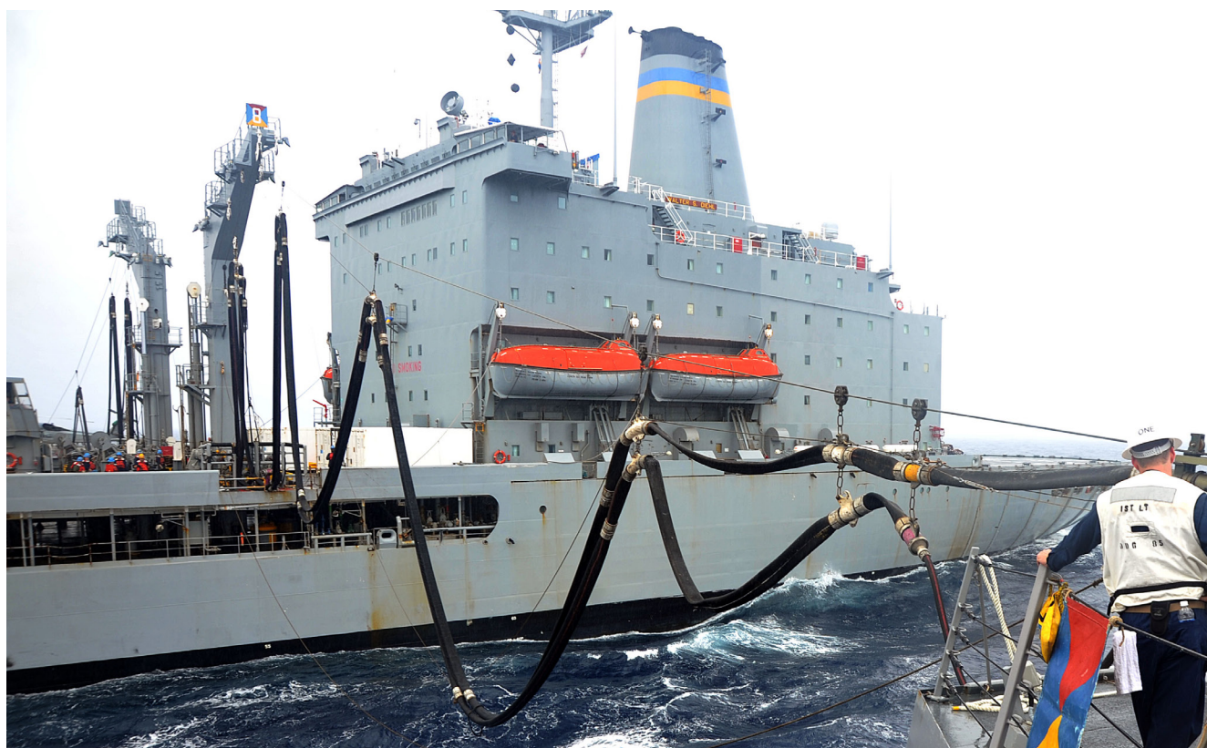
A Sailor looks on as a refueling probe pumps fuel into the ship during a replenishment at sea operation in the East China Sea.

and Industry (METI) official projects 20 percent of Japan's gas imports coming from the United States. 41 The United States' ability to bolster the energy security of Asian allies and partners would reinforce perceptions of US reliability and presence as an Asia-Pacific power. Australia, a close US treaty ally, is another major source of Asian gas exports. The combination of US and Australian gas contributing to East Asian energy security would be an important new strategic reality.