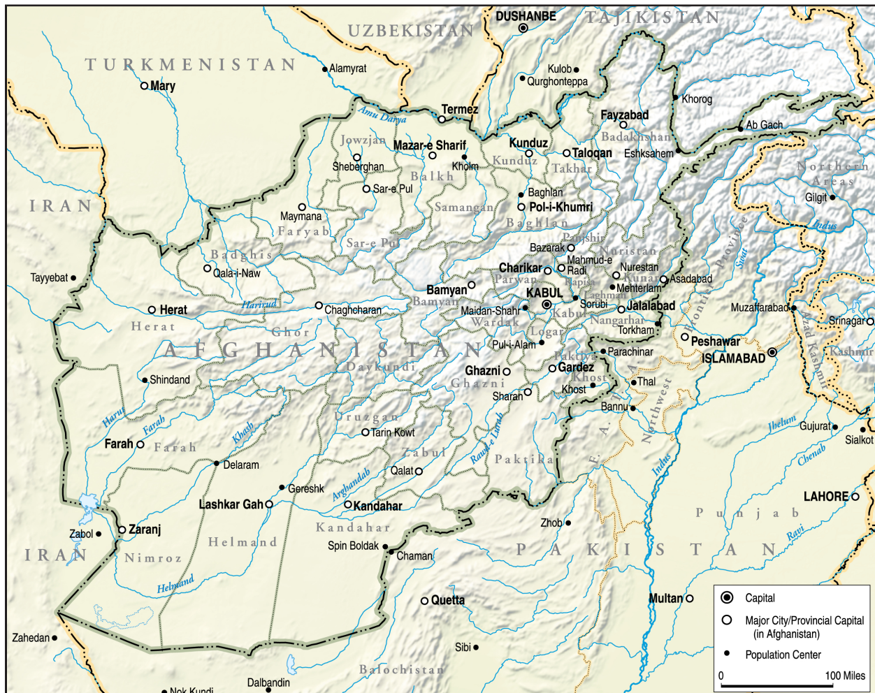
MAP 1: AFGHANISTAN

Political progress will take even longer to achieve and to gauge than security progress. The government will have to demonstrate increased willingness to stop and punish