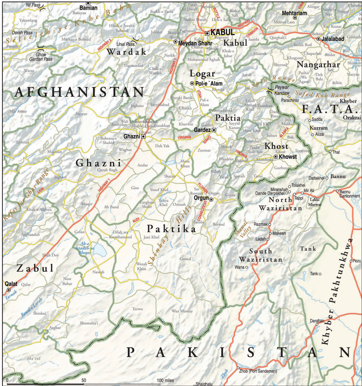
MAP 3: EASTERN AFGHANISTAN

on the Islamist groups in Waziristan and the Khyber-Pakhtunkhwa Province to do the governing and administering while it focuses on the global war. Afghans had very little interaction with al Qaeda, and so had no