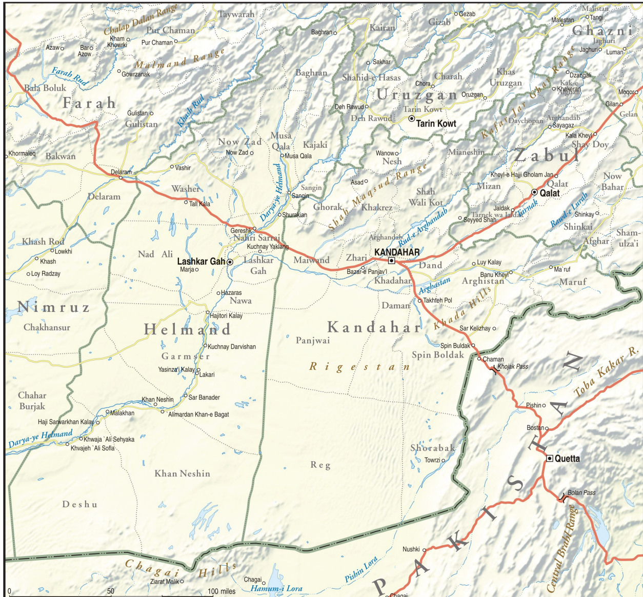
MAP 4: SOUTHERN AFGHANISTAN

they are” while also demonstrating the willingness of Pashtun populations not only to reject the Taliban, but to fight against them with limited, but dedicated, American help.