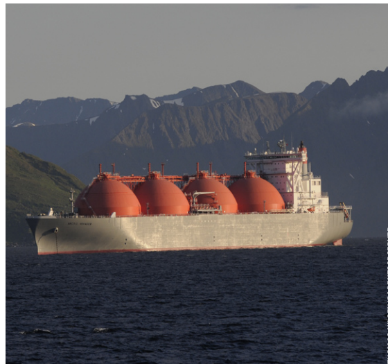
Tanker for liquefied natural gas (LNG) outside Hammerfest in northern Norway

'The unconventional gas boom should be viewed in conjunction with the development of international trade in liquefied natural gas (LNG).'