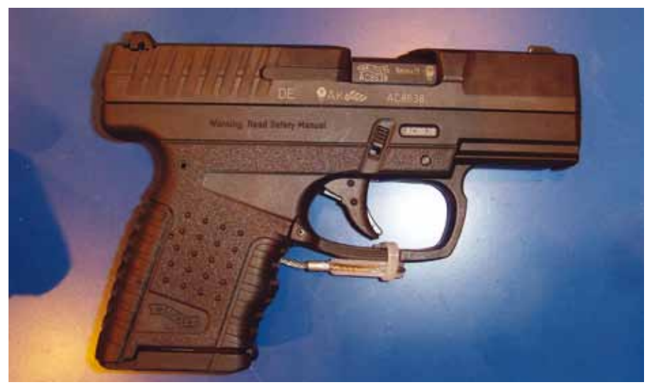
Polymer frames, increasingly used in firearms destined for the civilian market, present challenges in marking weapons durably.

Some states that took the floor during the MGE said that the markings on imported small arms were carefully recorded or that import was refused if serial numbers were not already present on the weapon. While both practices are important in ensuring the traceability of the weapon, neither replaces the application of an import mark identifying the country of last legal import. As explained above, this step can determine the success or failure of a trace.