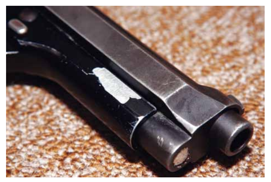
A pistol with its serial number scraped off, Rio de Janeiro, Brazil, May 2004. The gun was seized during the arrest of a 26-year-old drug dealer accused of killing several policemen.

Falsification, alteration, and erasure of markings. Much of the MGE marking discussion centred, explicitly or implicitly, on the problem of criminal attempts to falsify or sanitize markings. As indicated above, in conjunction with other factors, this difficulty influences the choice of marking methods. It also shapes weapons tracing strategies. Participants emphasized law enforcement tools such as the use of covert markings, applied by some manufacturers in addition to regular (visible) markings, along with proof markings, which, although unique, are often untouched by traffickers. They also mentioned strategies such as the development of new techniques for the recovery of sanitized markings and the use of evidentiary rules in the prosecution of weapons-related offences (shifting the burden of proof for suspects in possession of firearms with sanitized markings). Participants underlined the importance of criminalizing the removal or distortion of weapons markings.