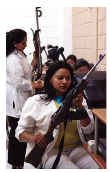
Criminal Investigation Division officials record details of guns during arms registration at the Registro Balistico in Tegucigalpa, Honduras, on 15 August 2005.

Several participants also emphasized the importance of the ITI provision requiring manufacturers and dealers that cease activity to forward their weapons records to the state (UNGA, 2005, para. 13).