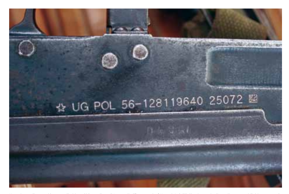
Ugandan police markings applied to a Chinese Type 56 assault rifle as part of Uganda's initiative to mark all small arms and light weapons in defence and security force inventories.

Several states noted that the ITI's reference to 'one or more national points of contact' (UNGA, 2005, para. 25) pointed to a division of functions, particularly between tracing operations and other aspects of ITI implementation, such as the exchange of information on national marking practices (para. 31b) or assistance needs (paras. 27-29). Numerous participants asserted that the tracing point of contact needed to be police-based given long-standing police experience in the protection of confidential information and international tracing practice, including cooperation among national police forces through INTERPOL's National Central Bureau system. Several states said that they had designated a single point of contact both for the PoA and for broader