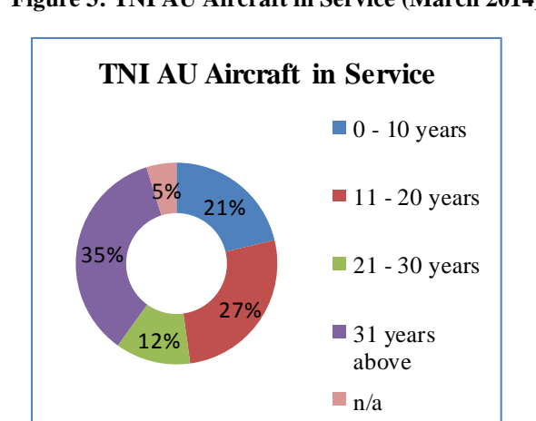
Figure 3: TNI AU Aircraft in Service (March 2014)

The Indonesian air force has placed an emphasis on modernising its armament capabilities vis-à-vis a number of jet fighter procurements over the past few years. Nevertheless, based on data adapted from IHS Jane's 2013, Figure 3, about 35 per cent of the TNI AU's aircraft have yet to be retired even after being in service for more than 30 years. Meanwhile, only 21 per cent of the total aircraft in service are in active use for less than 10 years and about 27 per cent of the aircraft have been used for a period of 11-20 years. Aircraft regeneration had therefore become a pressing issue for TNI AU. Table 1 and Table 2 illustrate the past and recent military procurements of the TNI AU based on information from IHS Jane in 2013.