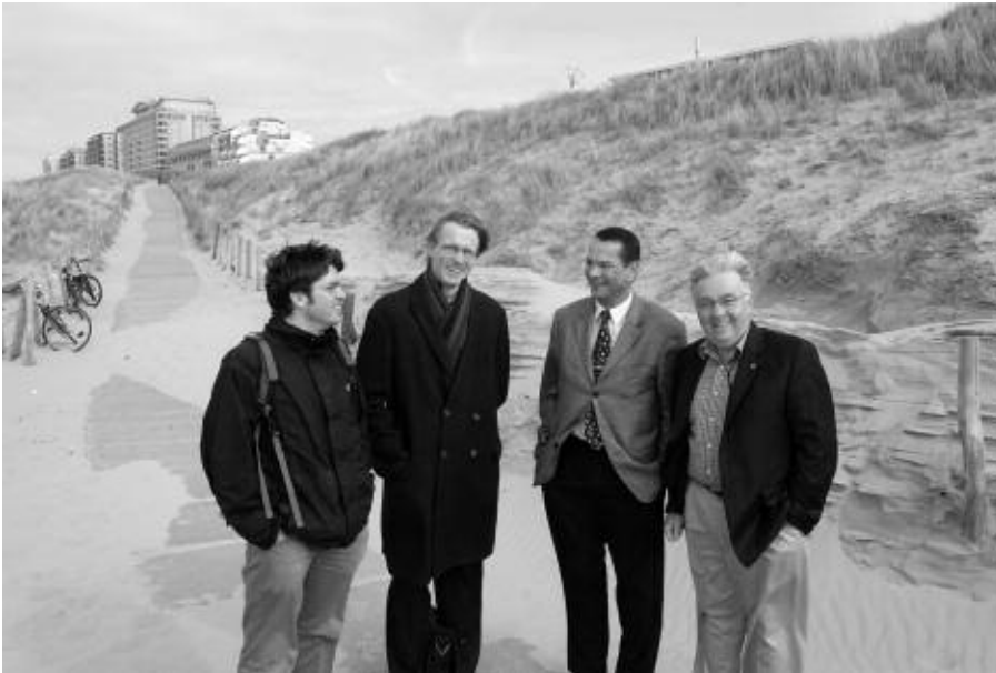
A Stroll on the Beach.

cut corners in terms of protecting worker safety, neighbouring communities and the environment.