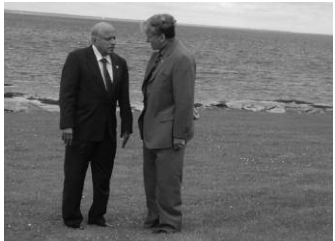
M.S. Swaminathan and Roméo Dallaire.

Last summer at the Thinkers’ Lodge, the Middle Powers Initiative convened a meeting of the Steering Committee and joined forces with Pugwash to produce this important Workshop. The Workshop’s goal is to produce an Action Plan, building on the Article VI Forum of the Middle Powers Initiative, to start negotiations on nuclear disarmament steps, which could lead to the conclusion of a Nuclear Weapons Convention or a frame-