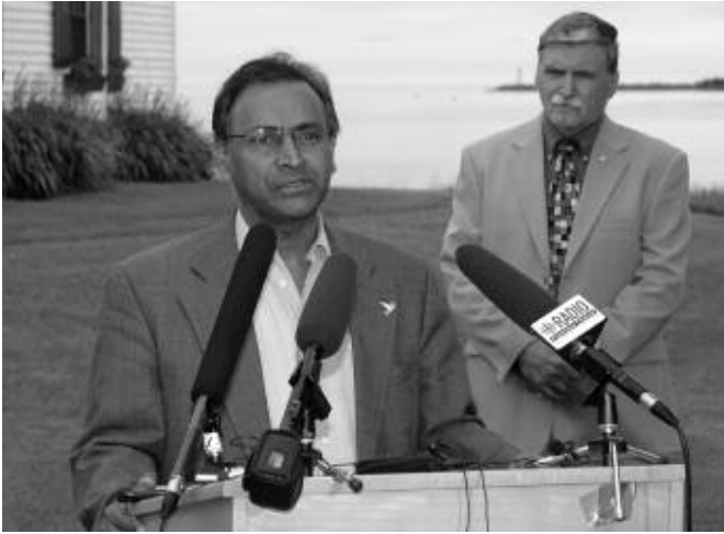
Jayantha Dhanapala and Roméo Dallaire at Workshop Press Conference.

way for a nuclear weapons free world. The NWS should acknowledge and respect all existing NWFZs by ratifying the appropriate protocols to the zones. States Parties to NWFZs are encouraged to enhance their cooperation in order to jointly promote nuclear disarmament initiatives. All efforts should be made for the establishment of additional NWFZs particularly in North East Asia, Central Europe, the Middle East and the Nordic/Arctic regions.