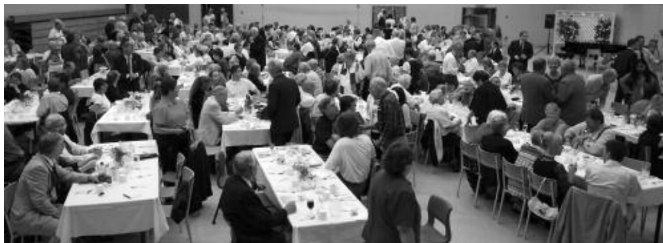
50th Anniversary Dinner at the Pugwash High School.

Prof. M.S. Swaminathan , President, Pugwash Conferences on Science and World Affairs; Chairman, National Commission on Farmers, Govt. of India