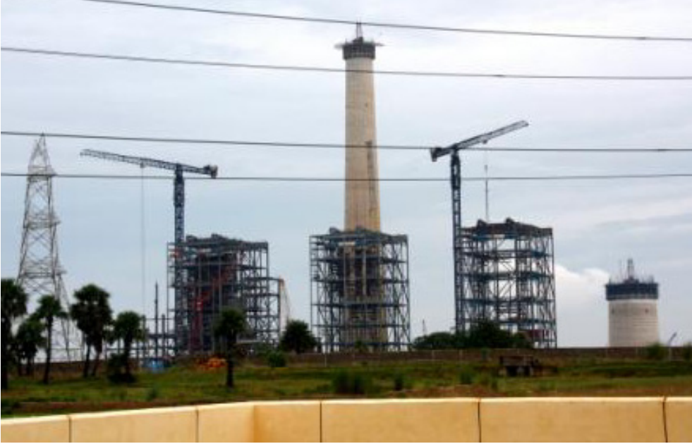
The GKEL power plant in Odisha.