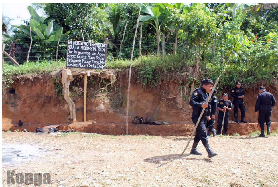
The IFC failed to classify the Santa Rita project as high risk despite severe conflict and repression of local indigenous communities.

However, it is extremely difficult to verify the IFC's figures relating to what proportion of its FI portfolio it classifies as high risk. This is largely because there is no transparency about the majority of projects supported by the IFC's FI clients, so there can be no independent verification of its claim. Until there is full disclosure—something CSOs and communities have been pressing for—we must simply take the IFC at their word. However, given the magnitude of IFC investments in the financial sector and the failure of the IFC to track and monitor its investments, it is probable that the scale of problem projects is in fact much greater than claimed.