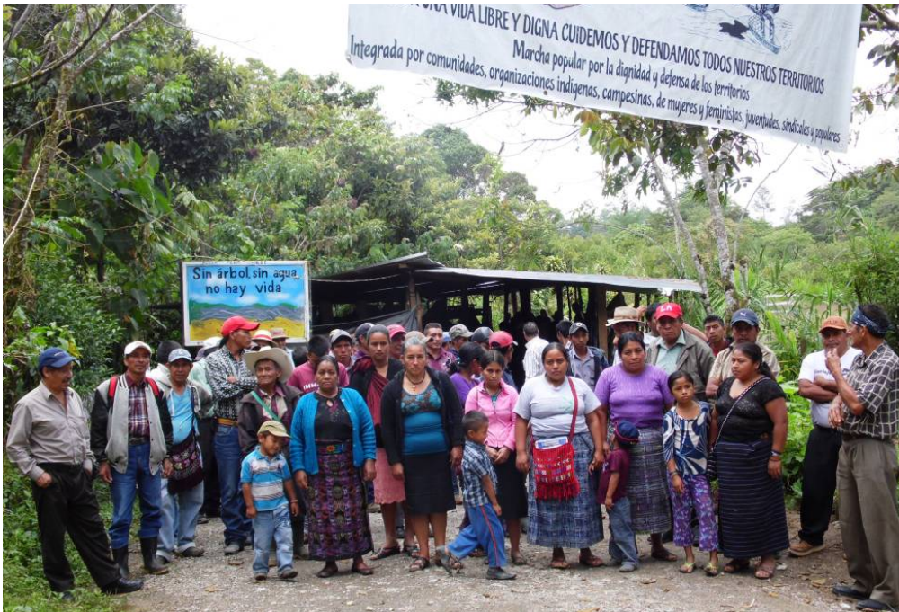
Women and men of Barillas maintain a passive resistance and reject the construction of a hydroelectric dam.