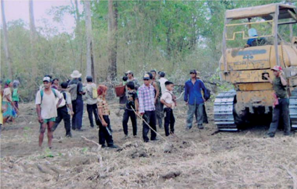
Kanat Thom community confront the company's bulldozer to protect their spirit forest.