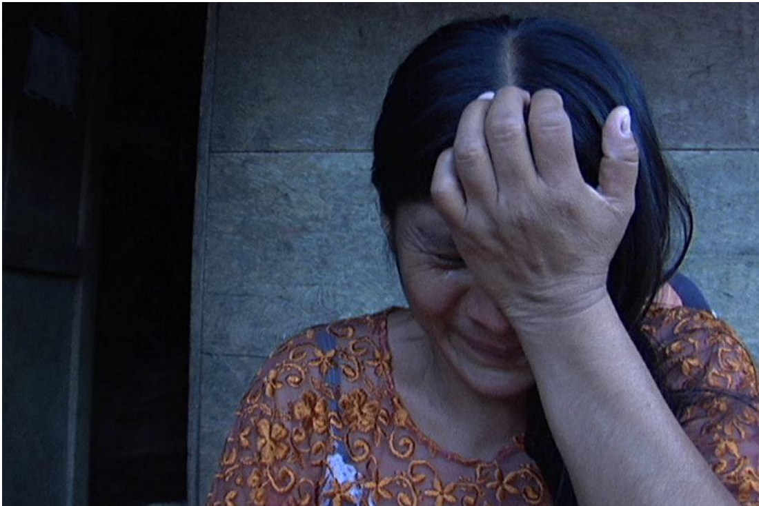
An indigenous woman in Monte Olivo, Guatemala, whose community has suffered repression linked to an IFC-backed project. 1

The human cost of the International Finance Corporation’s lending through financial intermediaries