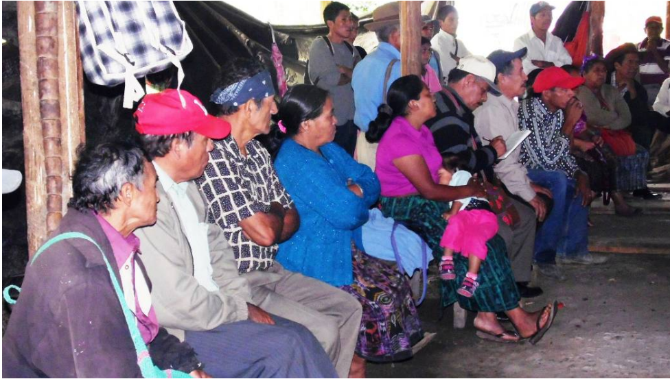
In a resistance camp, community members are informed about their rights and agree how to proceed with their case. They ask that organizations and citizens of Guatemala and the world continue to show solidarity with them.