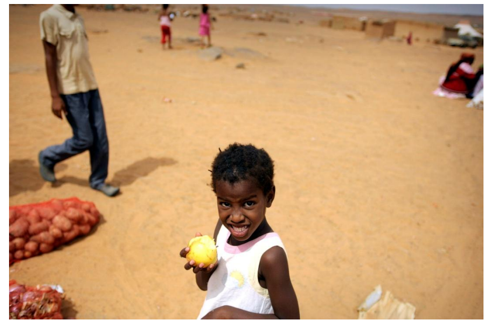
Oxfam distributes fresh produce (fruit and vegetables) in Smara refugee camp.

In the end, some essential nutritional requirements are still lacking. For example, monthly distributions of animal proteins – provided via supplies of tinned mackerel – were stopped in 2015 for economic reasons.