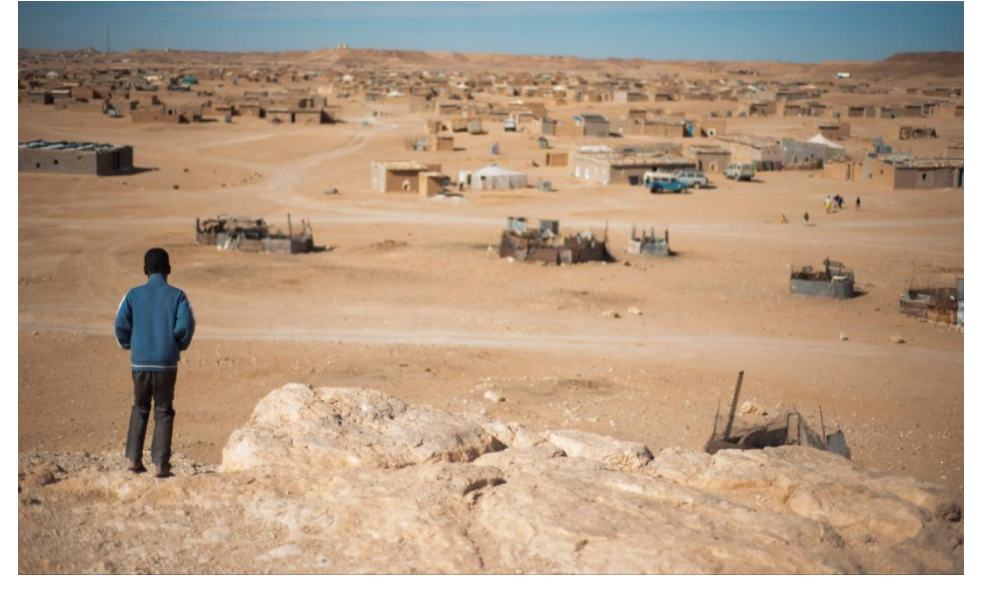
At a viewpoint above Laayoune refugee camp.

For Sahrawis keen to take back control of their lives, this also provides a new source of information for discussions and debates to accompany the tea ritual. They pay particular attention to their situation at international level, to the positioning of the UN and any potential impact on the decolonization process and the resolution of the conflict.