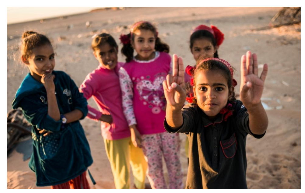
Children playing at sunset in Aousserd refugee camp, southwest Algeria

Neither the extreme humanitarian situation nor the growing frustration in the face of the status quo have succeeded in dispelling the refugees' ultimate hope of one day being able to return 'home'.