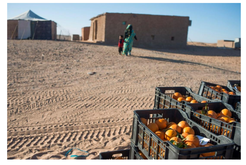
Oranges distributed by Oxfam in Boujdour refugee camp.

After a steady and continual decrease in funding over the last few years, 2015 presents a real challenge. Humanitarian workers have estimated the cost of humanitarian needs to be $37m, besides the basic food baskets distributed by the WFP. By November 2014, 75 percent of the needs identified – worth $28m – were not yet accounted for.