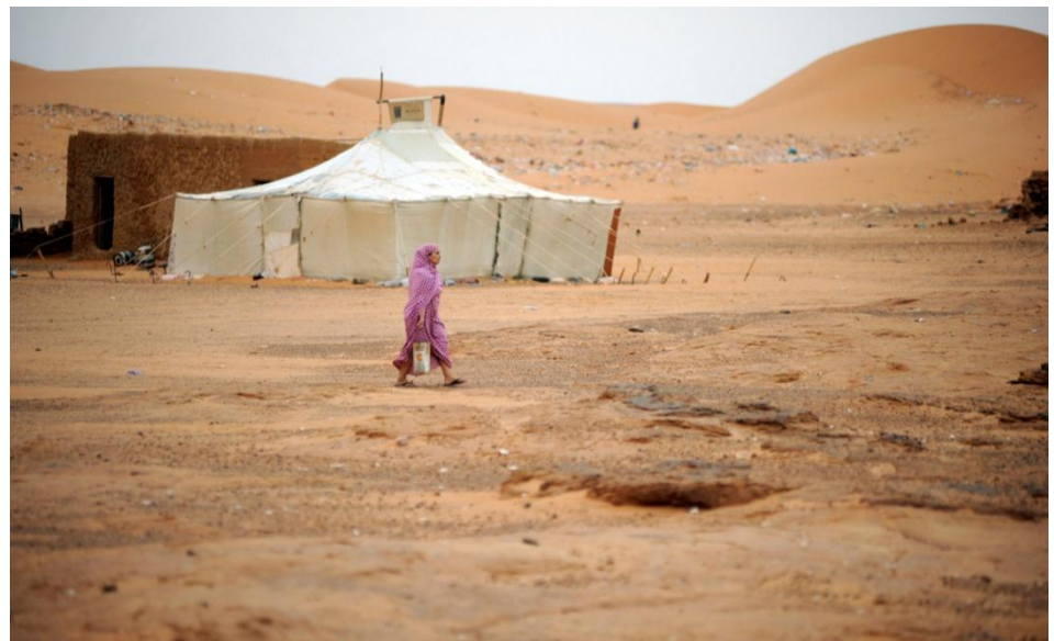
In Smara refugee camp, in southwest Algeria.

The arrival of these two nations claiming sovereignty over the Territory triggered an armed conflict with the Polisario Front, a liberation movement that the UN has considered the legitimate representative of the Sahrawi people since 1979.<sup>1</sup> This conflict marked the beginning of the refugee crisis.