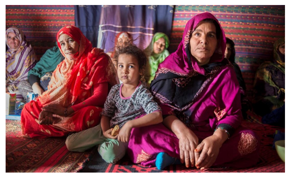
During an awareness-raising session on nutrition organized by the National Union of Sahrawi Women in Dakhla refugee camp.

In Sahrawi society, women traditionally play an important role in both the private and public spheres, a feature made evident by their role during the war for the Territory of Western Sahara – whilst men took part in armed combat, it was primarily women who established and organized the refugee camps. This historical factor has had direct repercussions on how public life is managed locally: today, all of the barrio leaders are women.