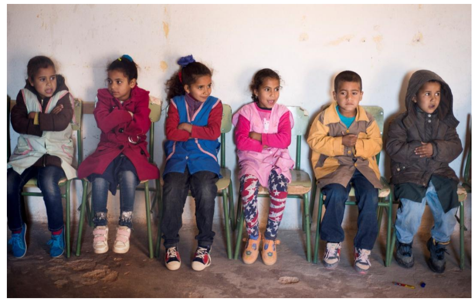
Children in a class for 7-8-year-olds in a primary school in Aousserd refugee camp.

Last September, the children in the refugee camps went back to school after the summer break– 32,028 returned to primary and middle school (up to the age of 16)<sup>9</sup> and 6,990 to nursery school. Literacy rates in the camps are remarkably high, but there are nevertheless a number of obstacles that get in the way of a high-quality education.