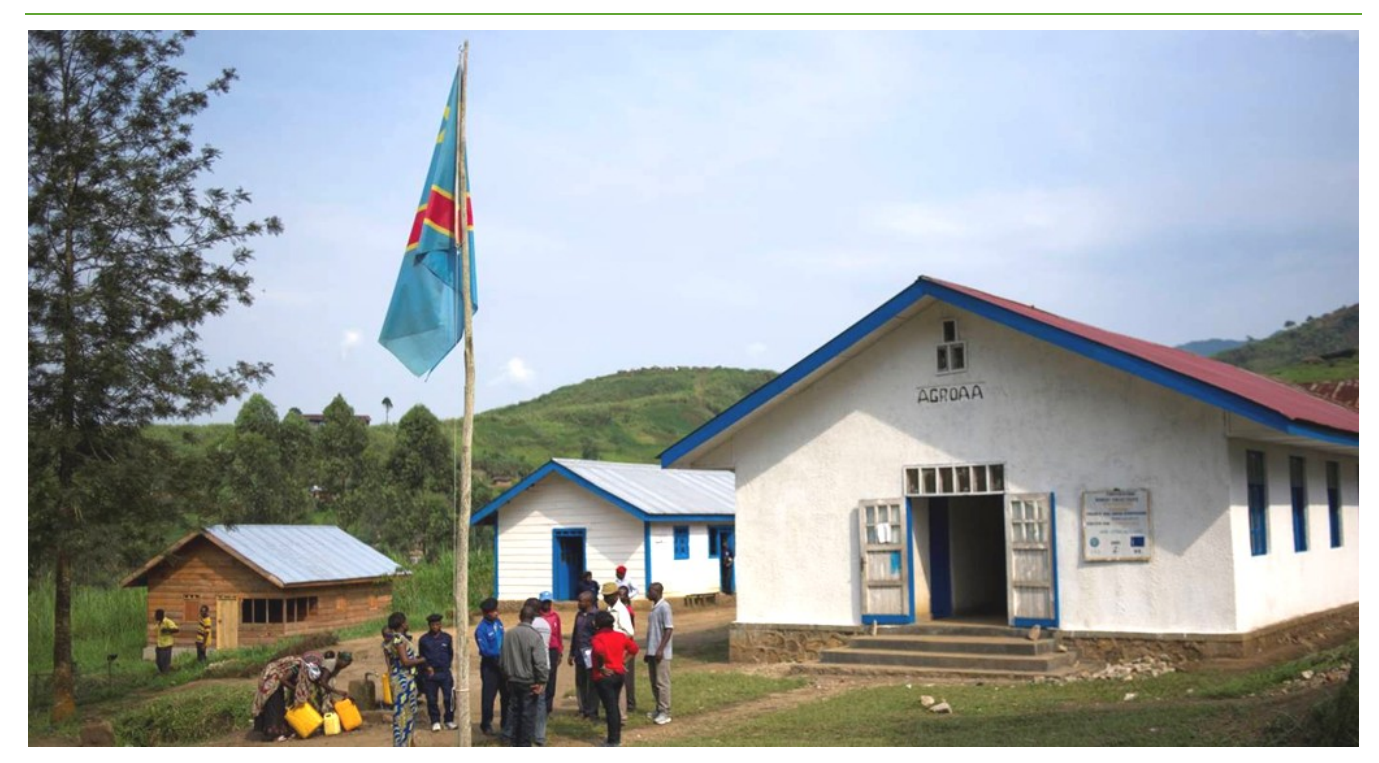
Local government office, Nyabiondo, Masisi territory, North Kivu.