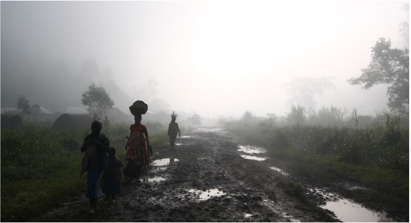
On the road between Kashuga and Mweso, Masisi, North Kivu, February 2013. A group of women and girls returning from the market.