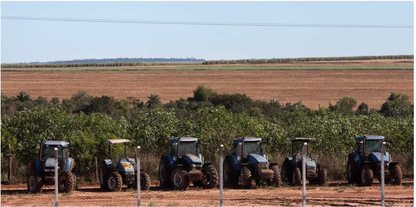
Tractors on a sugar cane plantation which occupies ancestral land of the indigenous group Guarani-Kaiowá. The displaced community now lives in a temporary camp next to the land on the side of Highway BR-163, Mato Grosso do Sul.