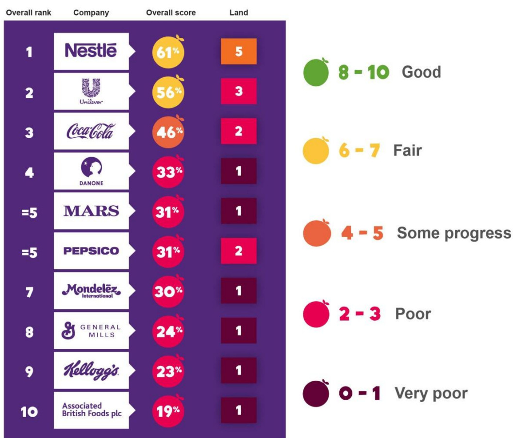
Figure 3: Behind the Brands scorecard results for land, 2013

This scorecard was produced in August 2013. To see the complete scorecard, go to http://oxfam.org/behindthebrands