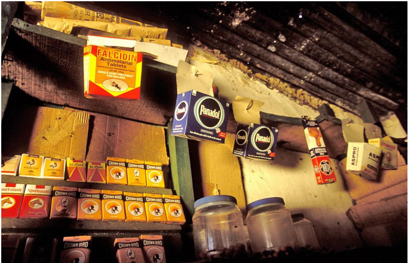
Local shop selling basic malaria medicines, Kilifi, Kenya.