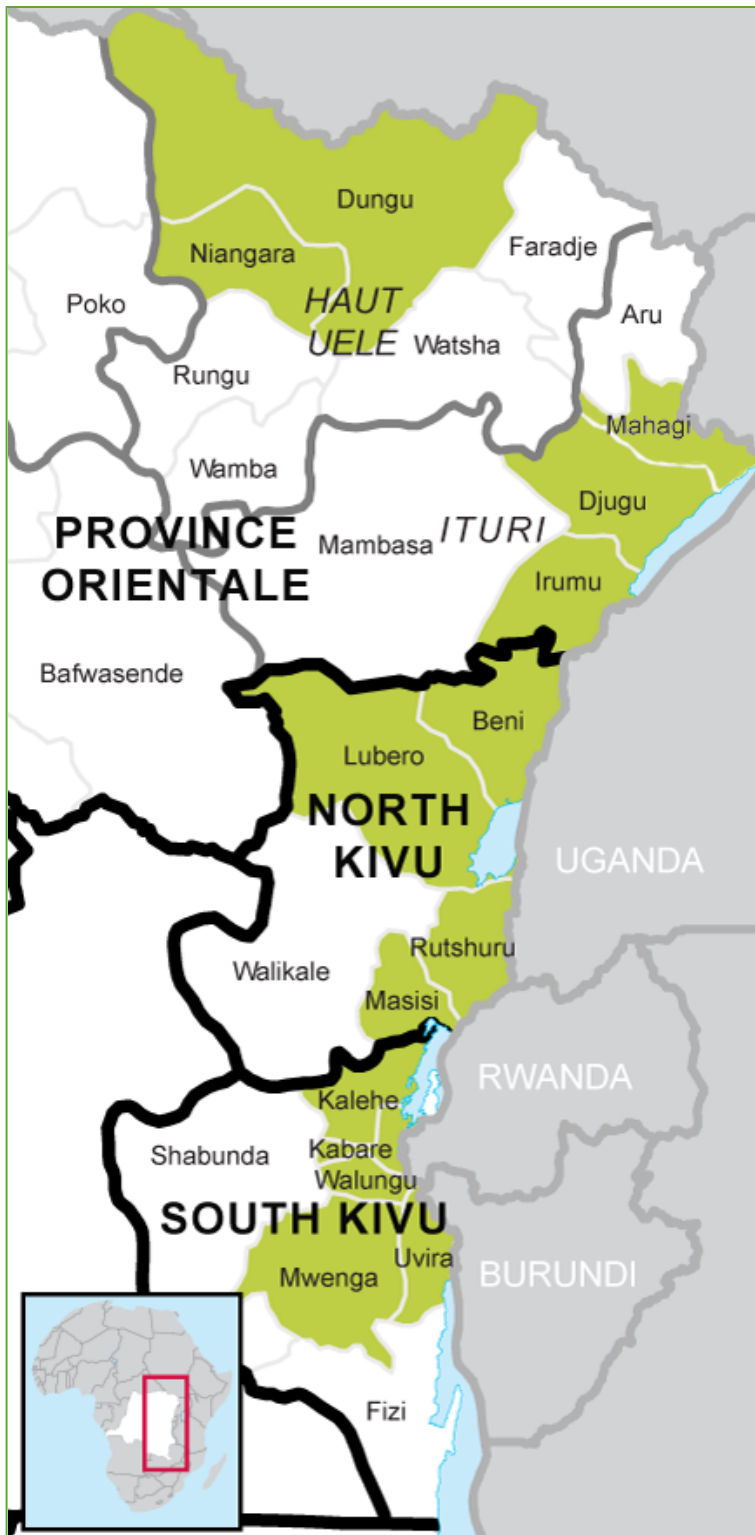
Map of eastern DRC showing the areas in which Oxfam's 2012 protection assessment was carried out