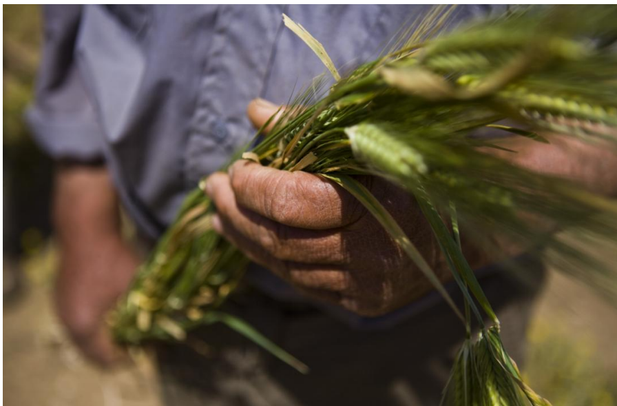
A Palestinian farmer harvests barley. Without adequate access to water Palestinian farmers are mostly planting rain fed grains.

Al Auja is a Palestinian agricultural community in the Jordan Valley. Suleiman Romanieen, head of the Al Auja Local Council, says: 'Al Auja is almost a desert now, but it used to be one of the richest places for water resources. For the past five to six years, it hasn't rained here and all the wells are dry. Before, it was only dry in summer, but now there is no water all year round. We cannot even access the spring as Israelis have closed the area.'