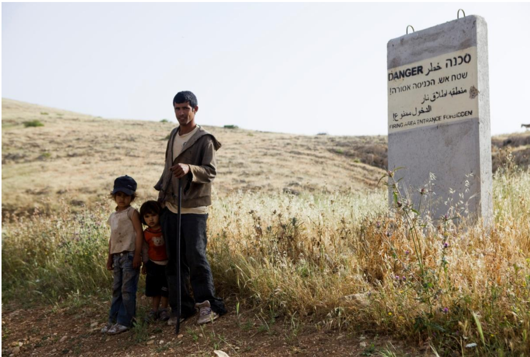
A Palestinian family in the Jordan Valley. They are unable to graze their animals because the land has been designated as a closed Israeli military zone.