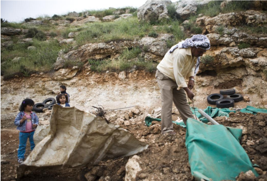
A Palestinian family sifts through the remnants of their home, which was demolished four times by the government of Israel in one year. Each time it was demolished they rebuilt using simple materials consisting mostly of plastic and metal.

Al Fariysiya, a Palestinian herder community in the northern Jordan Valley, is a community under threat. On 19 July 2010, the Israeli military demolished 26 residential tents, leaving 107 people, including 52 children, homeless. 58 They also demolished 22 animal pens, seven ovens, eight kitchens, ten bathrooms, and a shed used to store agricultural equipment. Four water tanks and large quantities of wheat and fodder for animal and human consumption were also destroyed.