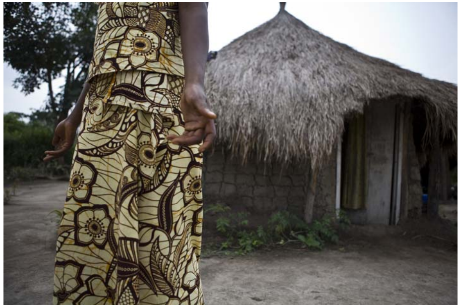
One of the 1.7 million displaced people in DRC in front of her home at an IDP camp in Province Orientale.

Each year Oxfam undertakes a far-reaching survey of unheard, conflict-affected people in eastern Democratic Republic of Congo. Three-quarters of the 1,705 people polled in 2011 said that they felt their security had not improved since last year. In areas affected by the Lord's Resistance Army (LRA), this figure rose to 90 per cent, with communities telling Oxfam that they felt abandoned, isolated, and vulnerable. Communities everywhere painted a grim picture of continued abuse of power by militias, the Congolese army, and other government authorities, wearing away their livelihoods and ability to cope.