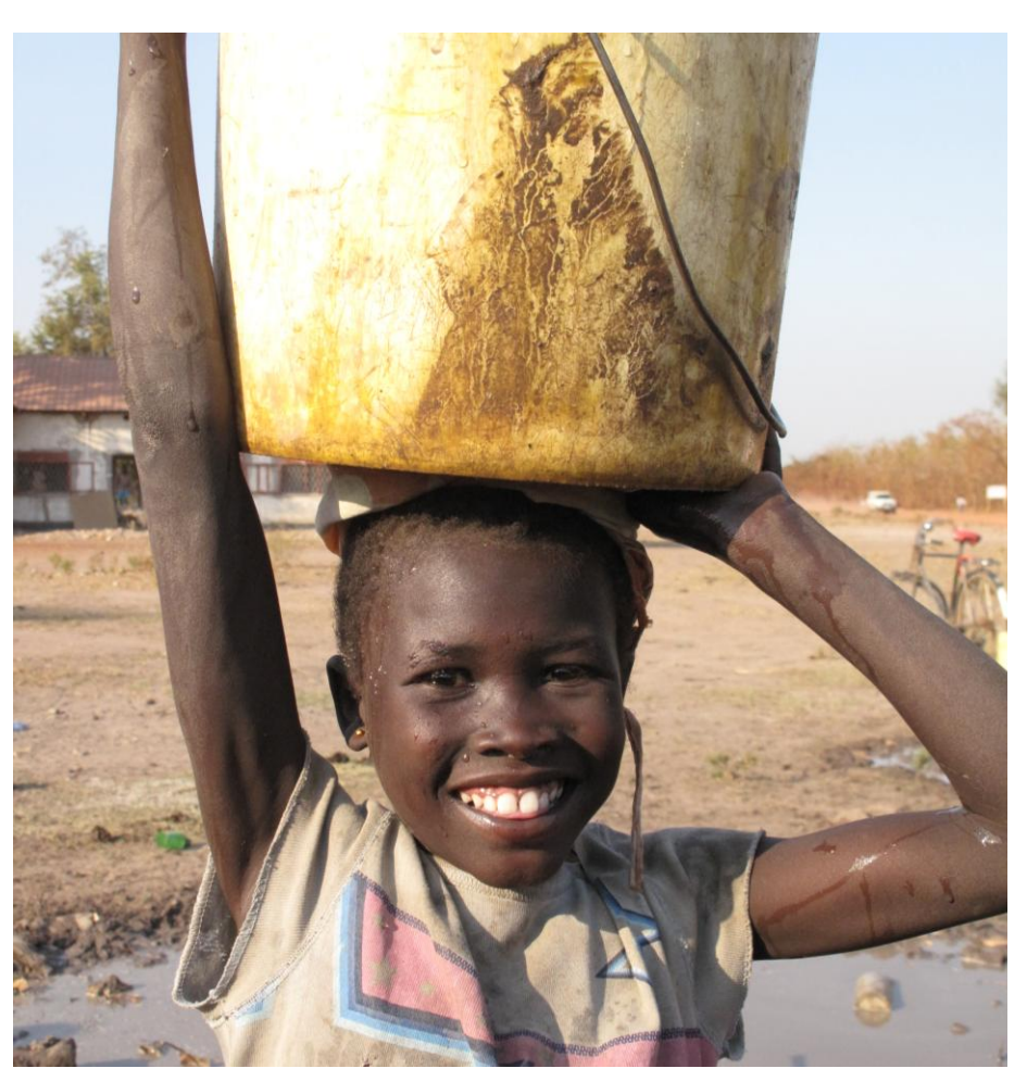
Girl getting water in Rumbek, 2010.

This report presents the views of 38 aid agencies working on peace-building, development, and humanitarian assistance in South Sudan.