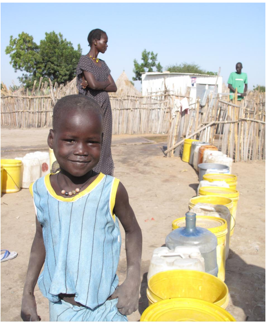
Girl at repaired borehole, Leer Town.

South Sudanese live in an environment in which livelihoods are constantly under threat: by climatic shocks, by conflict, and by a fluctuating global economy. Income shocks over the past year have been particularly harsh, and more than three million people throughout the country are either moderately or severely food insecure. Thousands of households engage in harmful coping strategies — including reducing food intake, selling productive assets, taking children out of school, and going into debt. With food prices continuing to rise, an ongoing influx of returnees and security continuing to deteriorate, food security levels could easily decline further — pushing more and more households towards these and other harmful coping strategies.