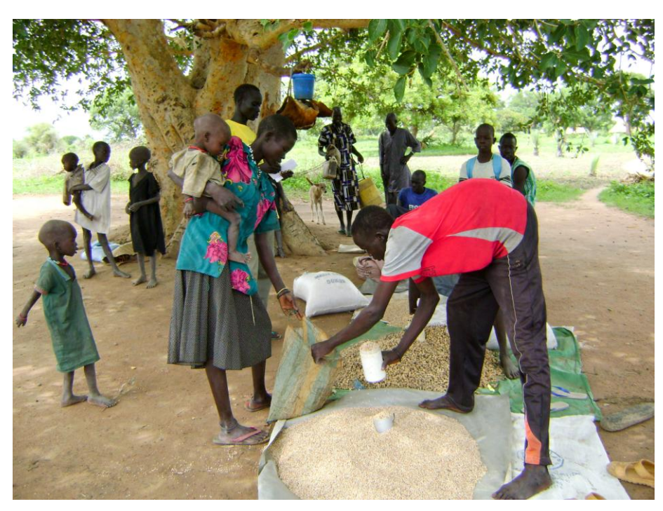
A woman receives local seeds of her choice in Warrap State, South Sudan. World Vision distributes seed coupons to help the community's poorest people buy seeds of their choice locally.

Throughout the CPA interim period, humanitarian and development assistance in South Sudan has in large part consisted of single sector interventions, in many cases focused on the symptoms of a problem rather than addressing what is almost always a multiplicity of underlying causes. This is perhaps attributable to the multitude of challenges and complexities that have been described throughout this paper: an everchanging context that fails to sit neatly in a humanitarian, recovery or development box; an enormously challenging operating environment; and the difficulty of understanding the drivers and dynamics of the conflict.