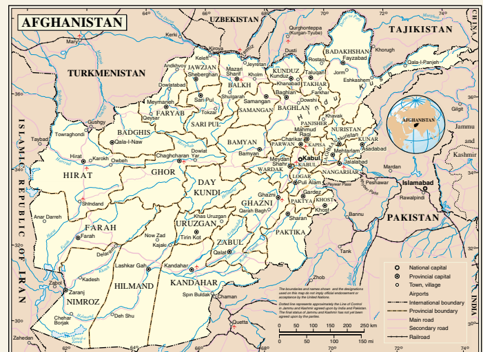
Map No. 3558 Rev. 5 UNITED NATIONS Department of Peacekeeping Operations October 2005 Geographic Section

After nine years of engagement in Afghanistan, the international community is also grappling with its own major economic challenges, and is preparing to reduce