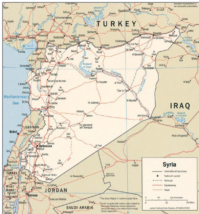
Map 1: Syria and its neighbours

their derived entities have now been firmly consecrated. 2 Nineteen months later, and in light of the destructive energies stirred by the Syrian conflict, one wonders if this remains true: Has indeed the post-colonial territorial framework been consecrated? Are we not, alternatively, witnessing the relative demise of the colonial order brought about at the end of World War I?