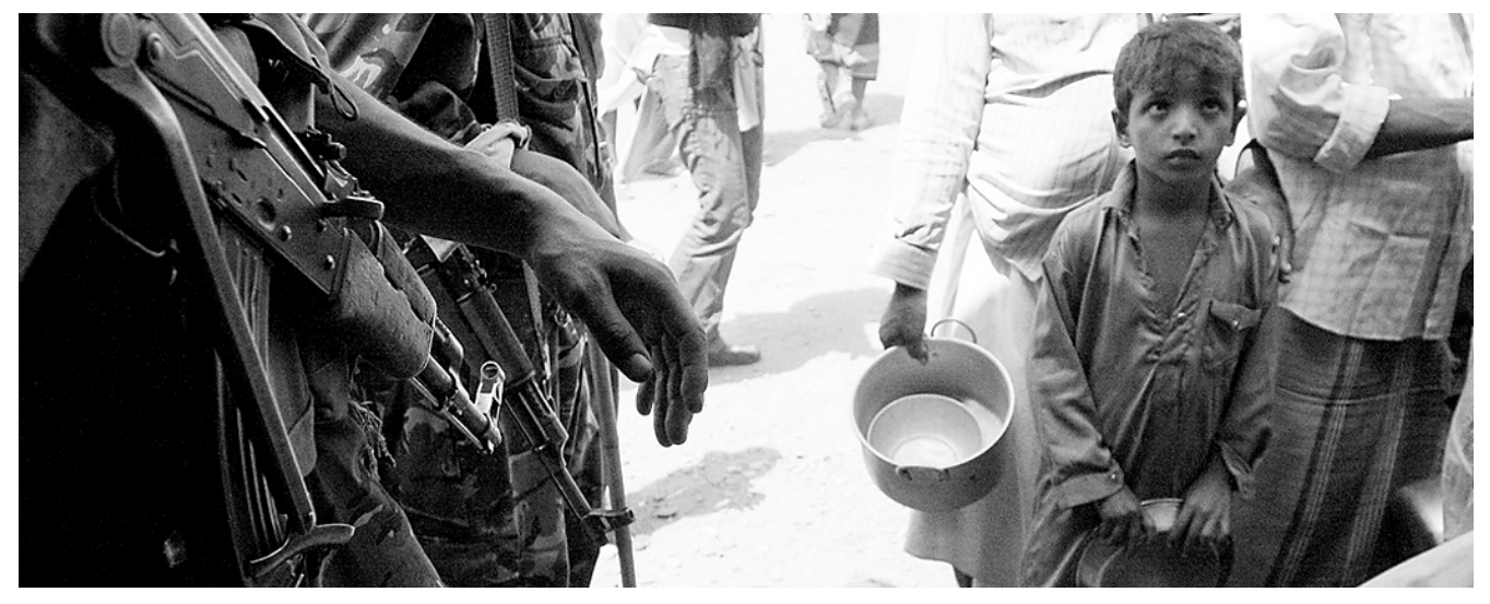
A boy waits in line for food at the Mazraq refugee camp in Hajjah province, Yemen.

As a result, a patchwork of different systems of government—some more democratic, some less—seems the most likely long-term outcome of the current uprising. In the meantime, and until the dust has settled, the Middle East will experience a fair amount of uncertainty and unrest which, in some cases, might escalate into civil war-like confrontations. While this situation will require much attention and assistance from the international community, the latter will remain relatively powerless in determining the outcome of this transformation.