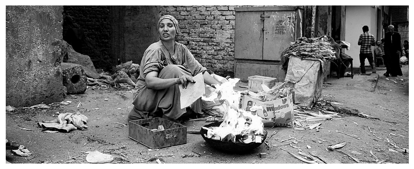
A woman selling corn in Cairo's Zabbaleen District. Rising food prices have increased the cost of living for many Egyptians.

The overthrow of autocratic governments in Egypt and Tunisia has radically changed the course of Middle Eastern politics. Emboldened by the peaceful mass protests that brought Ben Ali and Mubarak to their knees, young protesters have taken to the streets in many Arab capitals, demanding a better life and a more accountable government. Demographics and the political momentum seem to be on their side.