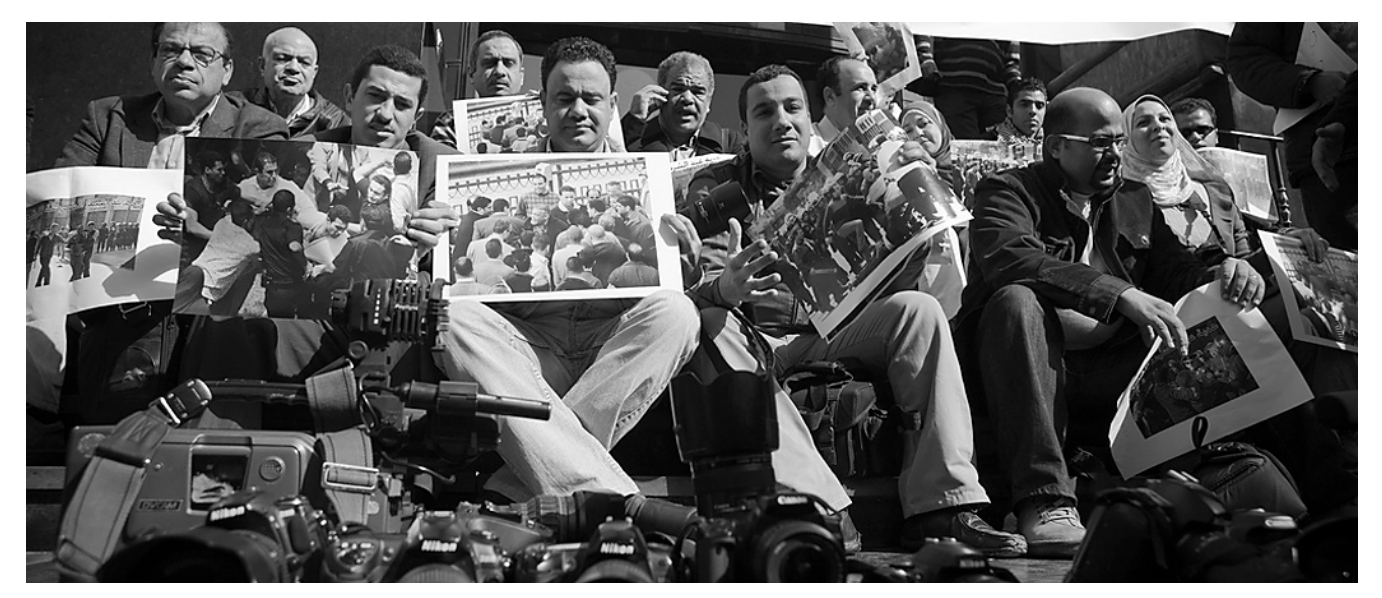
Egyptian photographers protesting. In recent years the Mubarak regime has cracked down on independent media.

main concern was that open information concerning the widespread political disturbances would incite further troubles for the Egyptian regime.