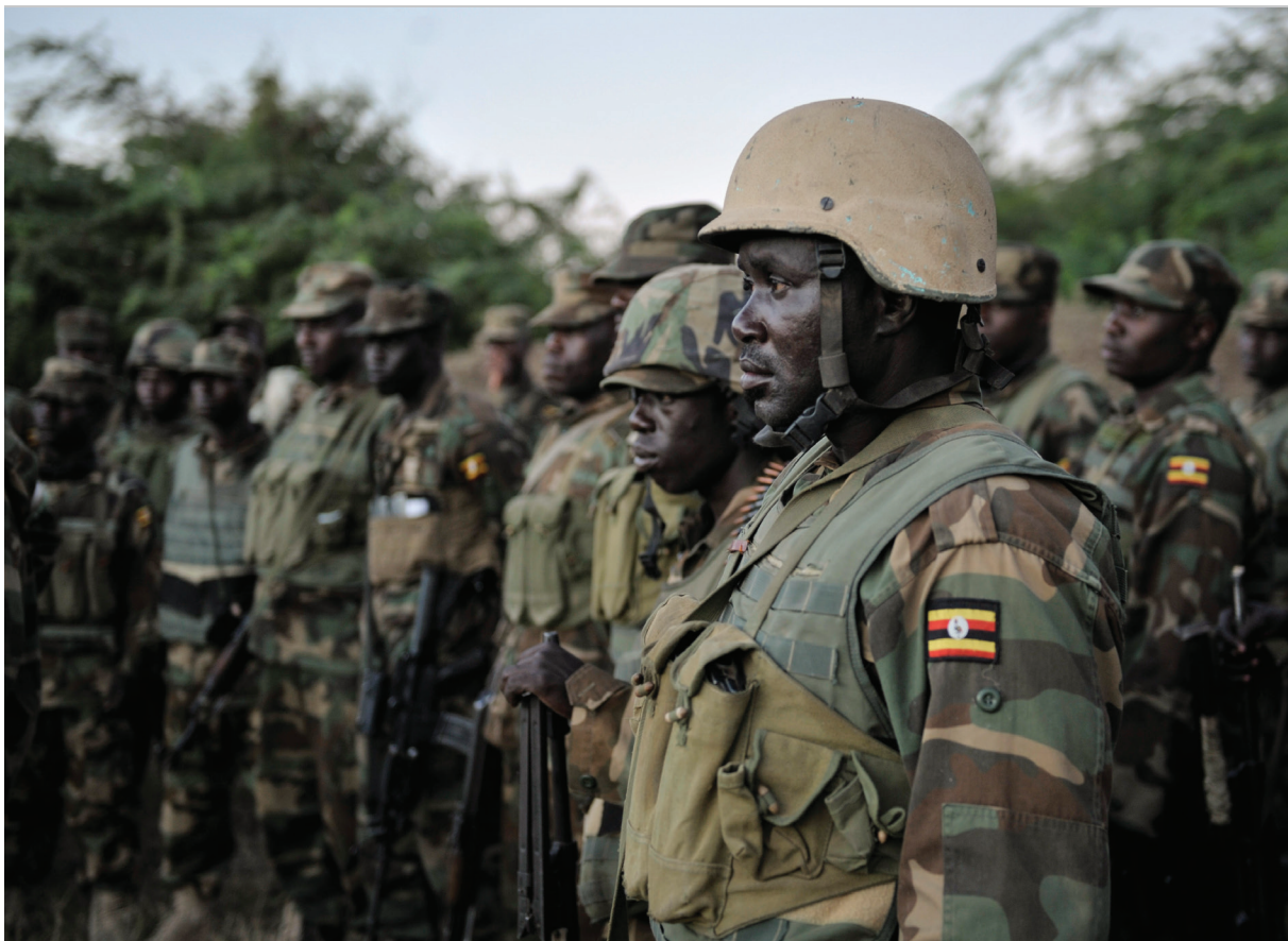
Soldiers from AMISON, 2014.