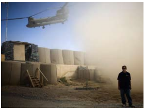
A US contractor looks away from a dust cloud whipped up by a helicopter departing over a gatepost Kandahar, Afghanistan, 2010.

As the US Armed Forces changed their behaviour, the need to ensure the consent of the private military companies was highlighted since non-consent would jeopardize the efficiency of the US effort. At that time, however, the local population still perceived the behaviour of the private military companies as confrontational and antagonistic, which ran counter with the overall aims of the new strategy. At the heart of COIN, and also of the SURGE strategy, also lay the fight for legitimacy, upholding rule of law, and holding violators of the rule of law accountable. But while the US promoted this strategy in relation to the local population, the local population could see that the private military companies largely enjoyed impunity. Since this of course undermined the effort, this problem must be dealt with in future situations of this kind.