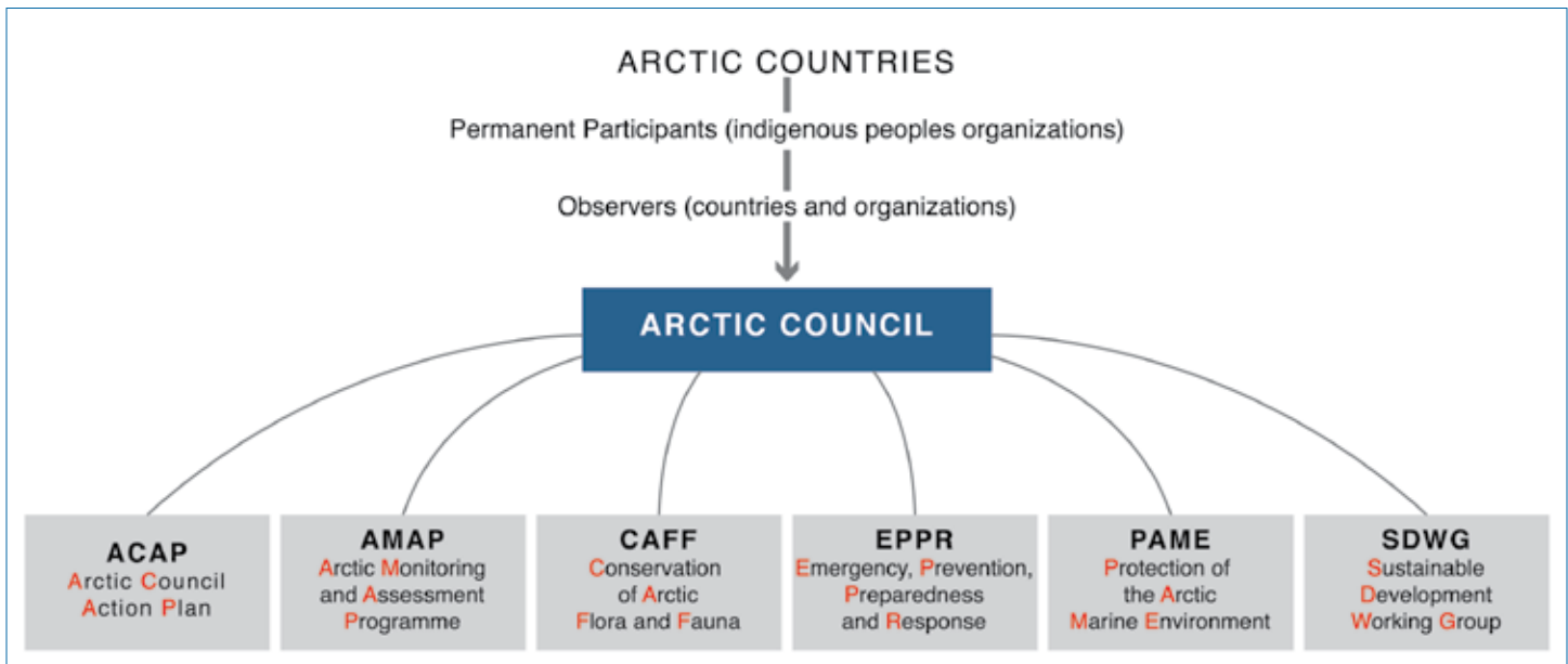
Figure 1: Organizational Structure of the Arctic Council