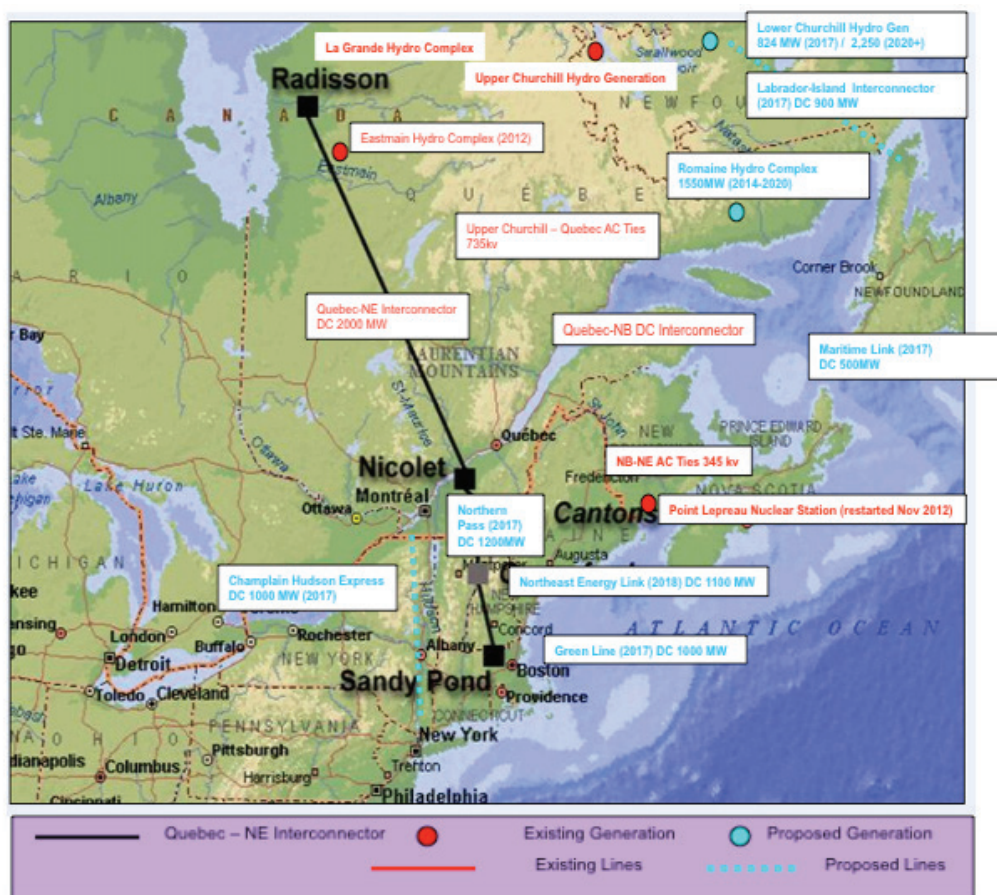
FIGURE 1: SNAPSHOT OF CERTAIN EXISTING AND PROPOSED GENERATION AND TRANSMISSION PROJECTS IN EASTERN CANADA AND THE NORTHEAST UNITED STATES